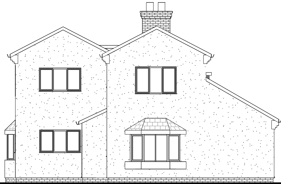
3 Existing - East Elevation 1 : 100