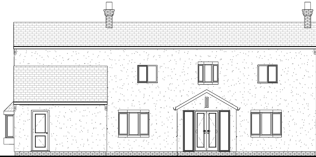
1 Existing - North Elevation 1 : 100