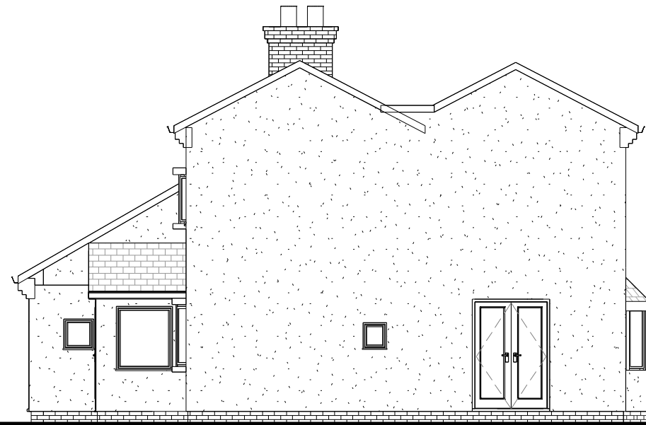
4 Existing - West Elevation 1 : 100

Note : - Do not scale. Only use figured dimensions. - All information contained within this drawing remains the copyright of ASM Architecture and must not be copied without written consent from the owner.