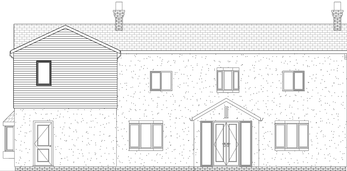
1 Proposed - North Elevation 1 : 100