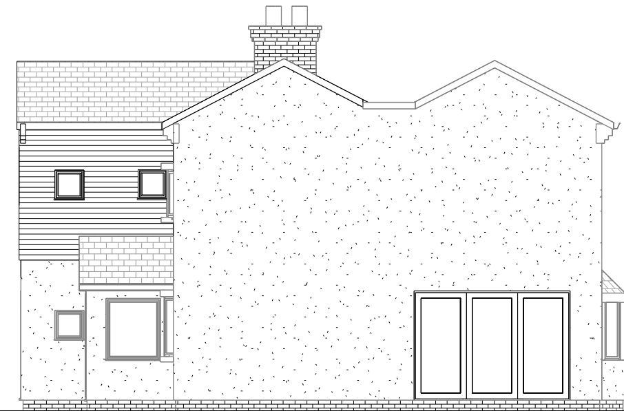
4 Proposed - West Elevation 1 : 100

Note : - Do not scale. Only use figured dimensions. - All information contained within this drawing remains the copyright of ASM Architecture and must not be copied without written consent from the owner.