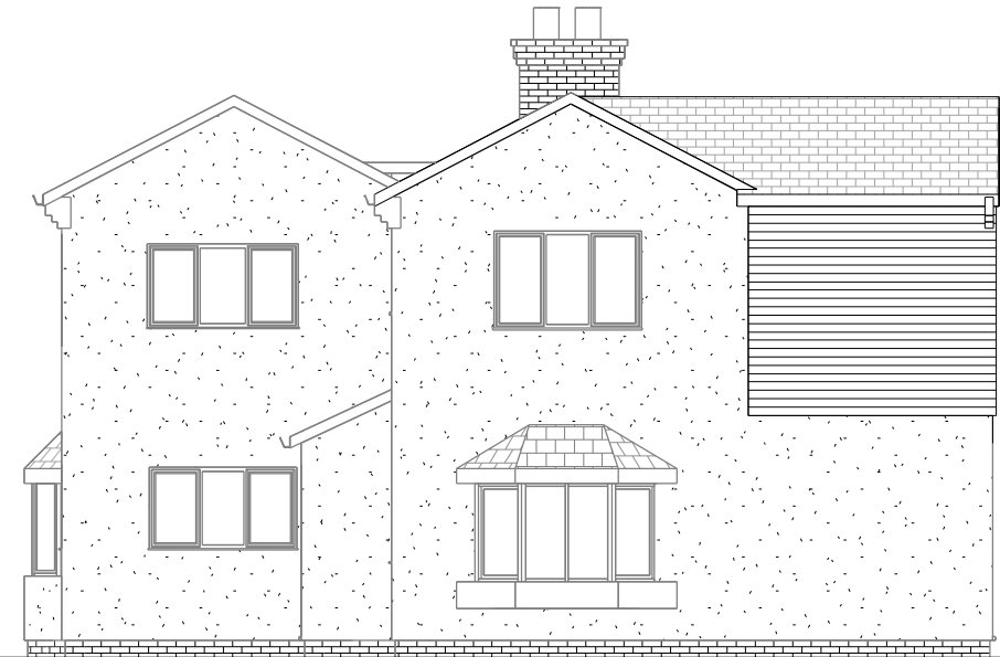
3 Proposed - East Elevation 1 : 100