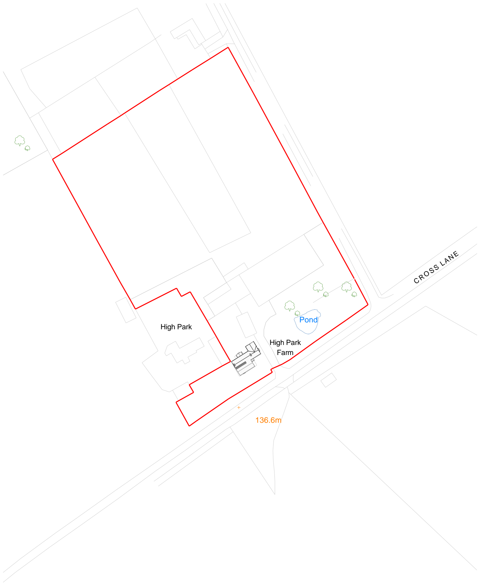
1 | Site 1 : 1250