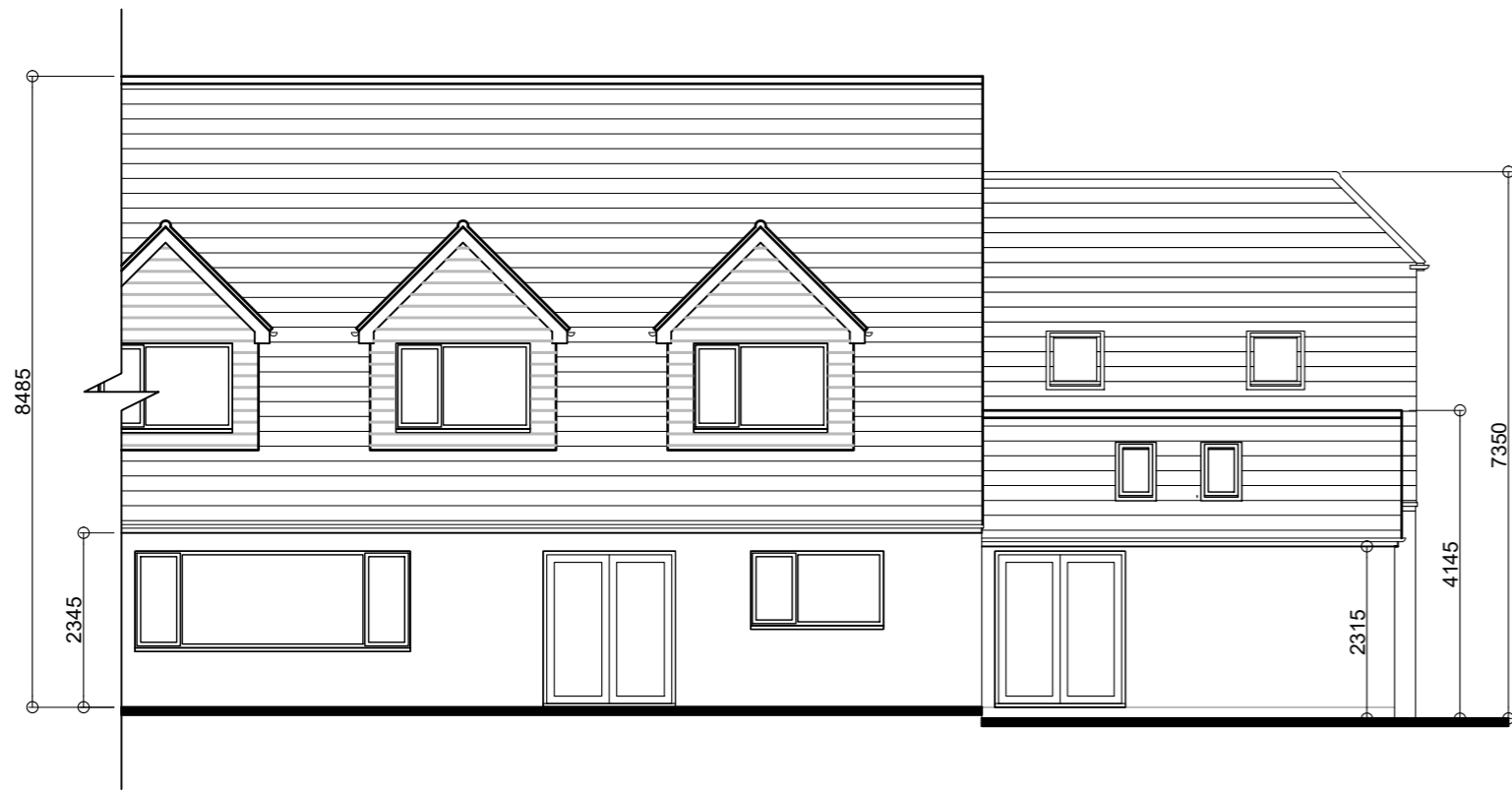
Existing Partial Rear (South) Elevation Scale 1:100