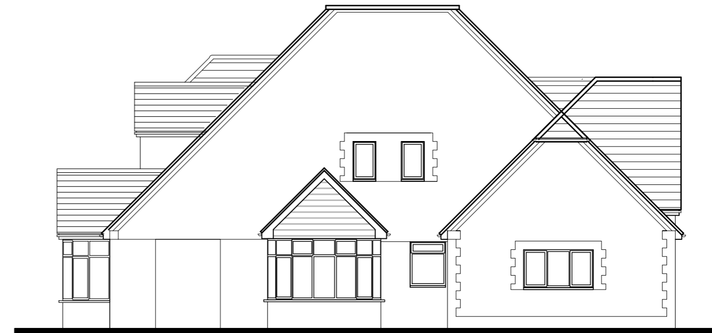
Existing Side (West) Elevation