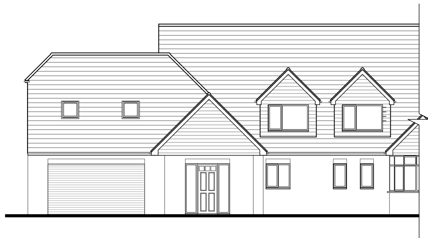
Existing Partial Front (North) Elevation