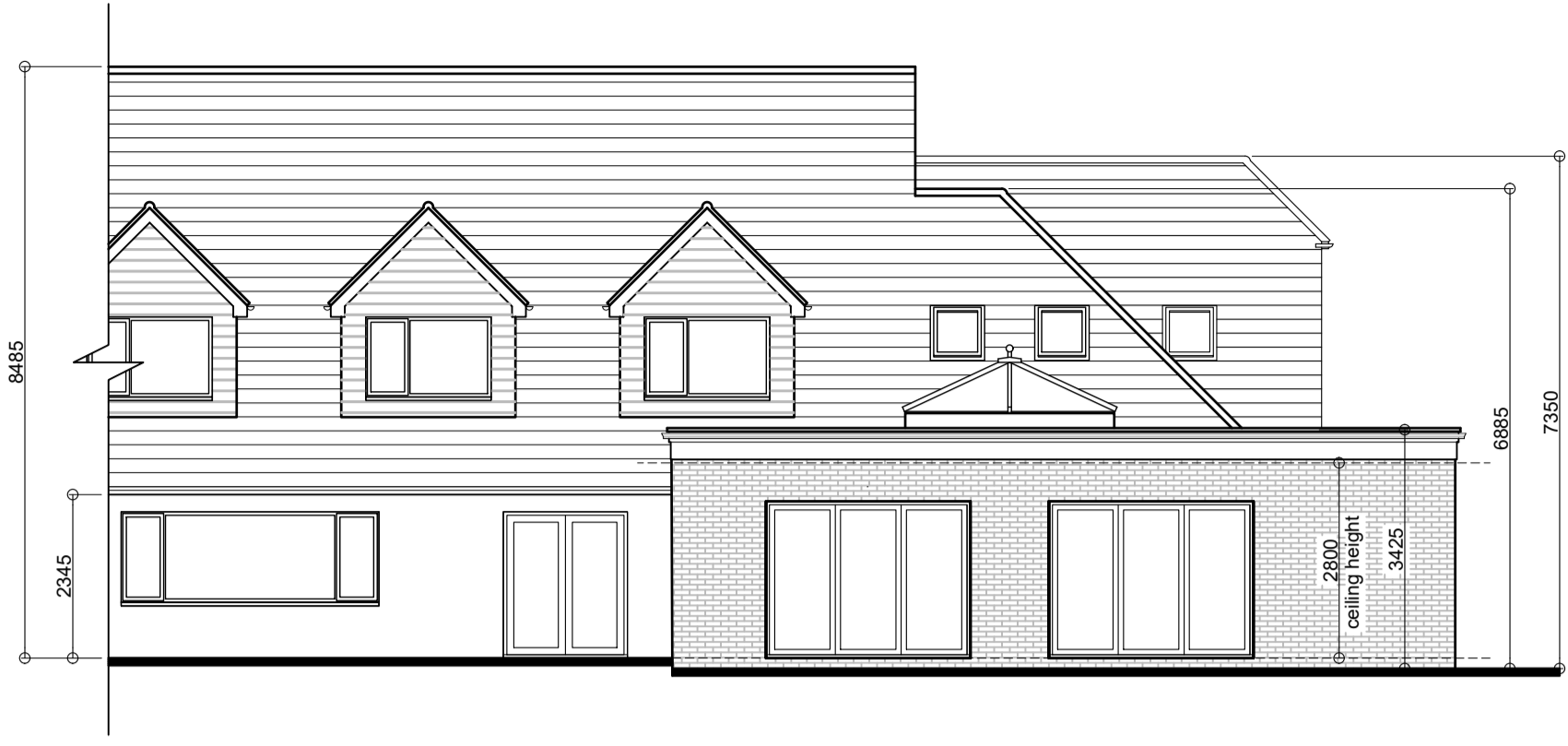
Proposed Partial Rear (South) Elevation Scale 1:100