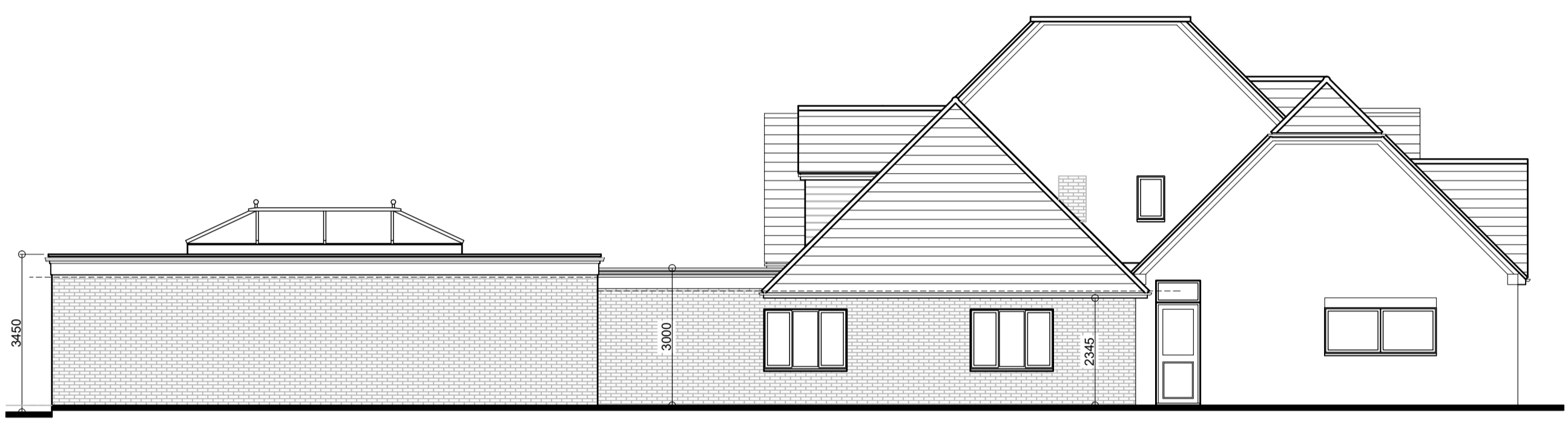
Proposed Side (East) Elevation