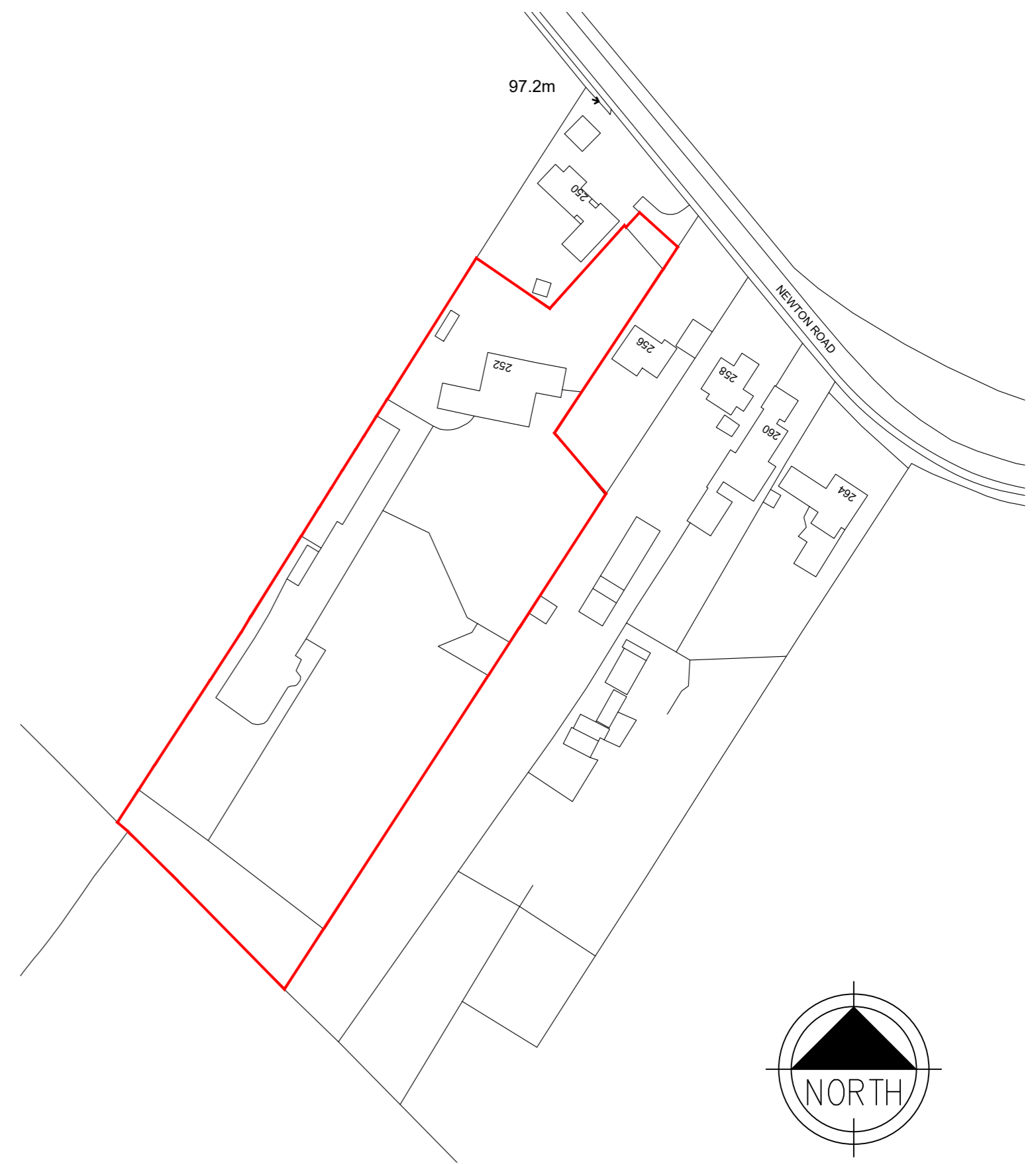
Site Location Plan Scale 1:1250