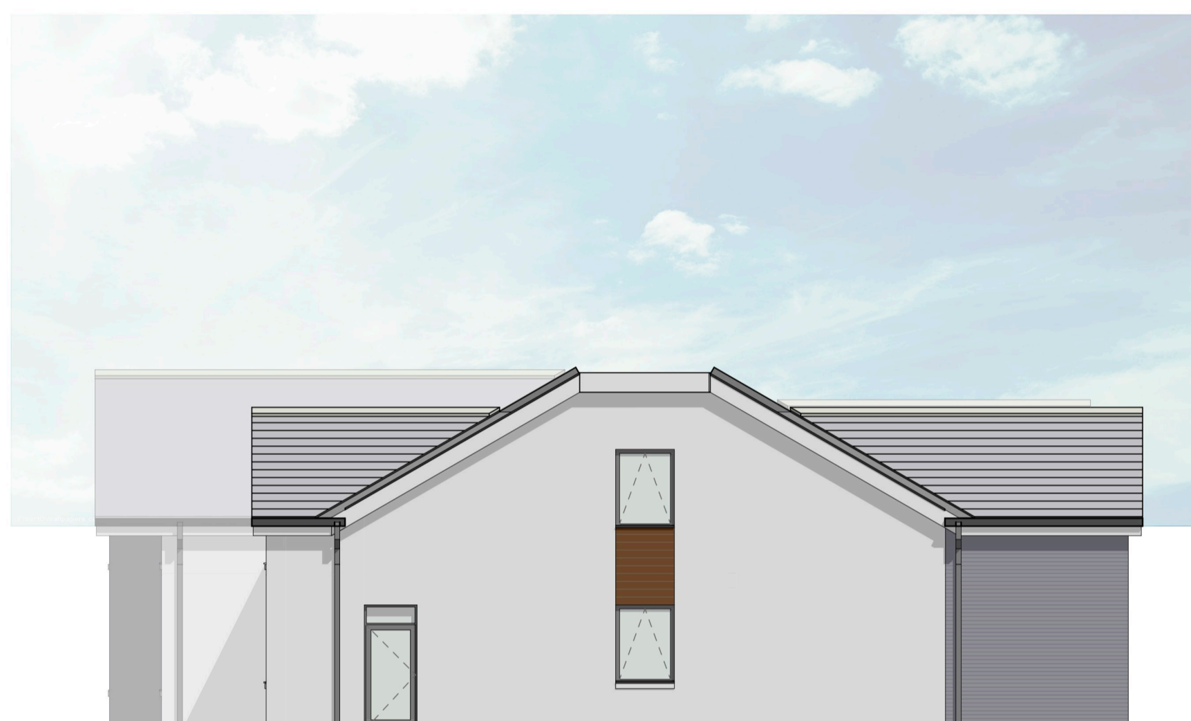
Side Elevation (North)