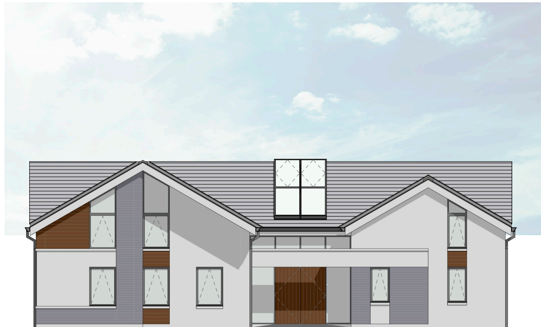
Frontage Elevation to Park Avenue (East)