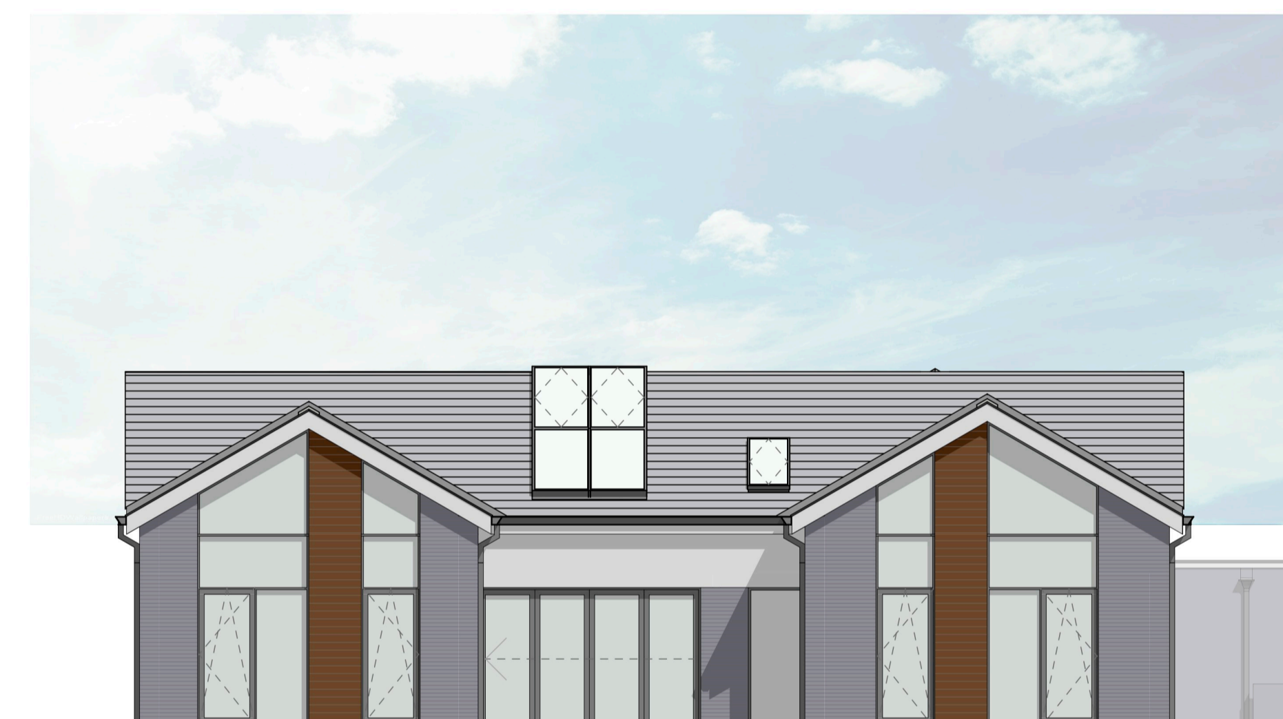
Rear Elevation (West)