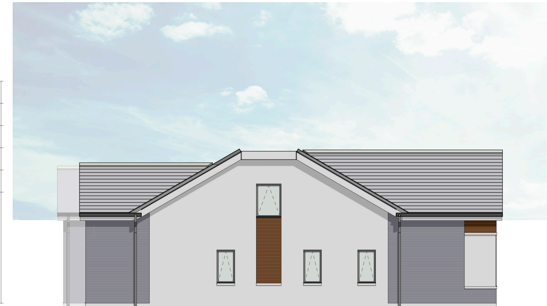
Side Elevation (South)