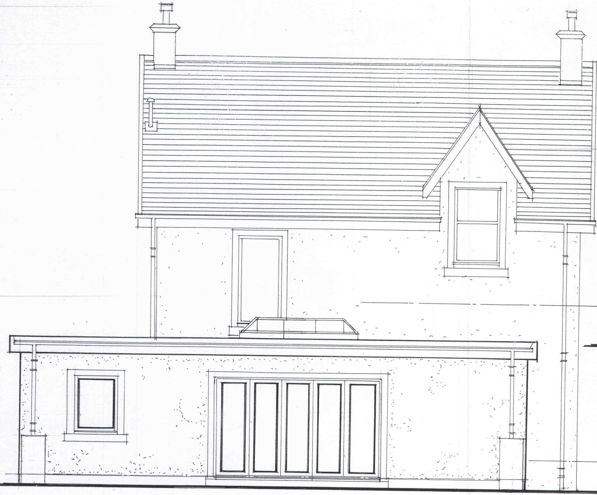
REAR ELEVATION 1:50 - (SOUTH)