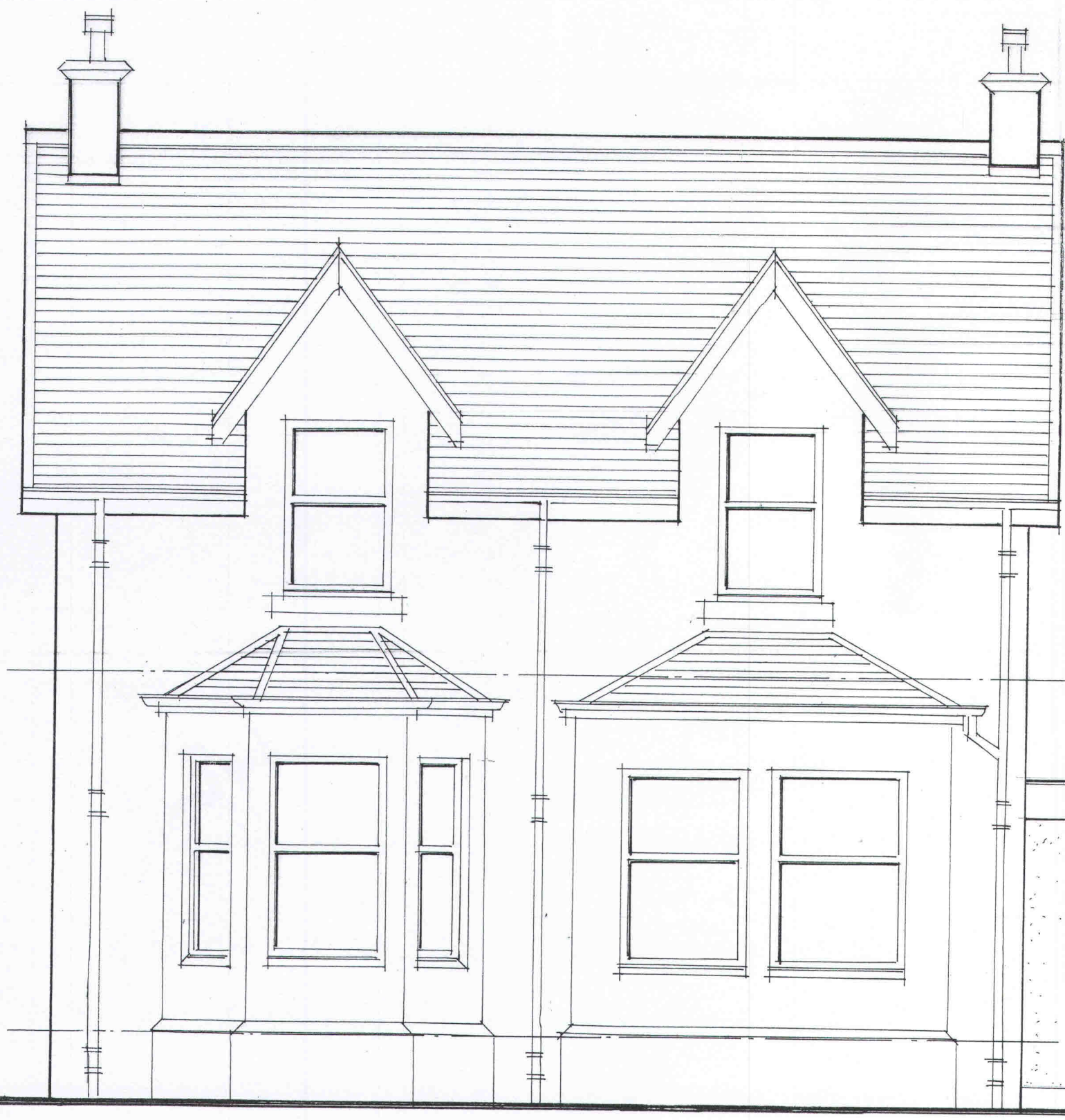
FRONT ELEVATION 1:50 (NORTH)