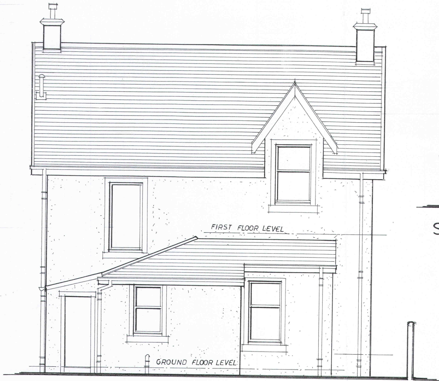
REAR (SOUTH) ELEVATION 1:50