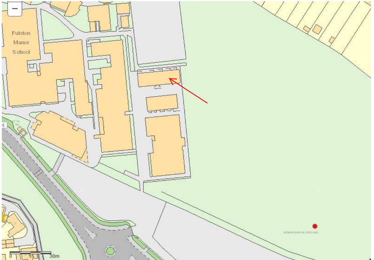
Figure 2. KCCHER map and location of site (red arrow) with Roman cemetery to the SE (red dot)