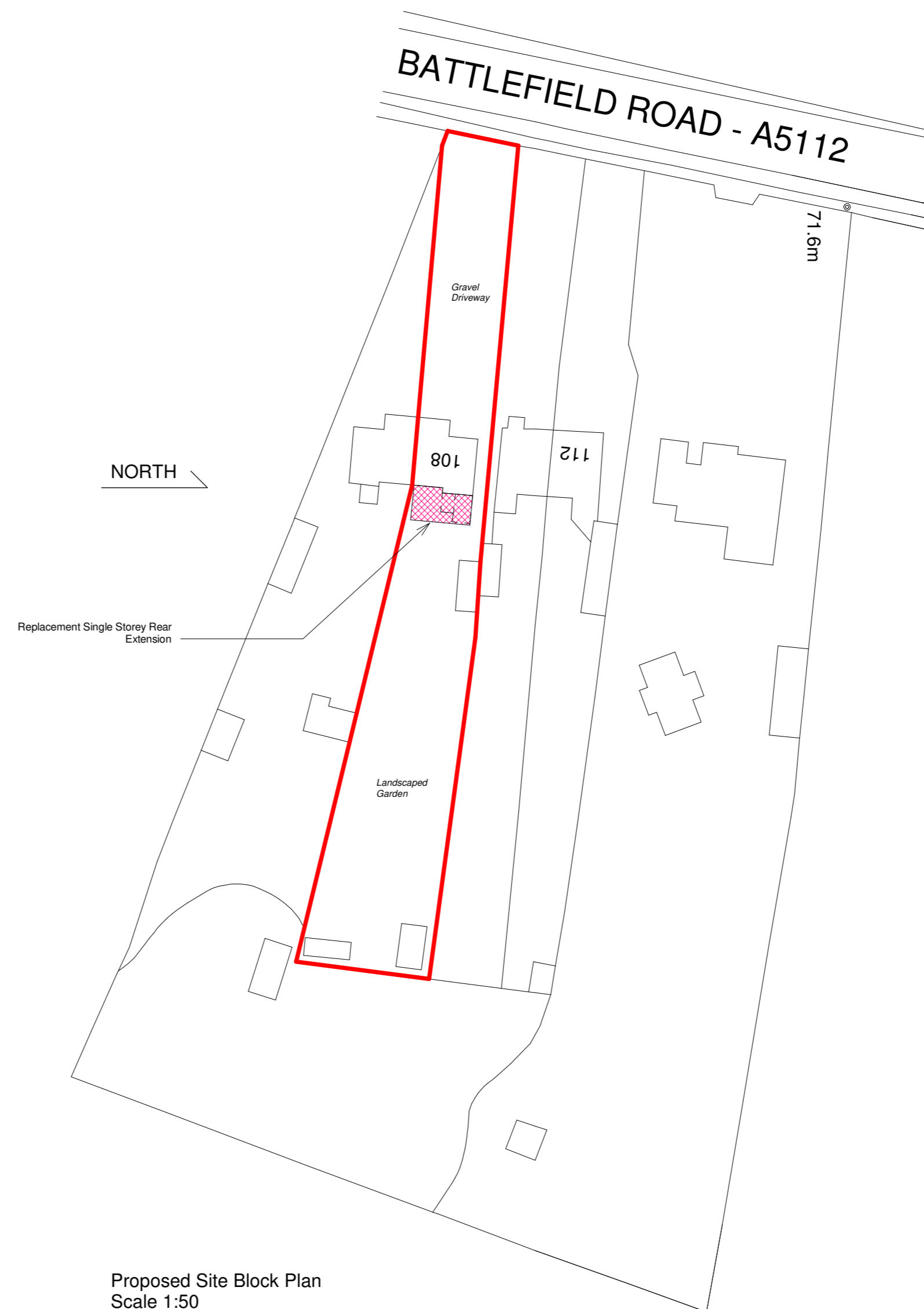
Proposed Site Block Plan Scale 1:50

Block Plan Based On Ordnance Survey 100053143