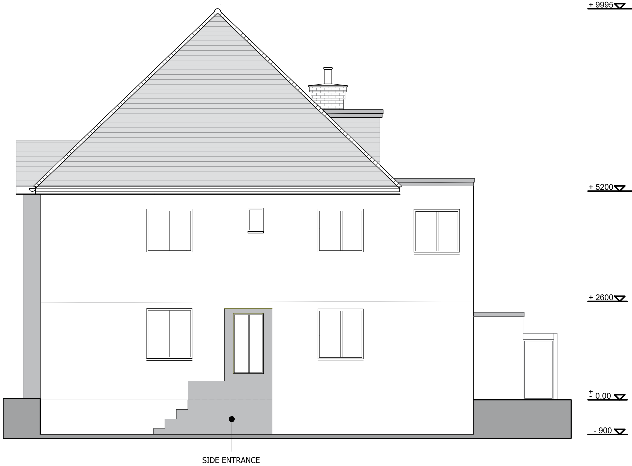
RIGHT SIDE ELEVATION SCALE 1 :50