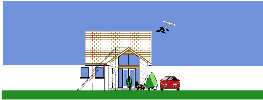
PROP WEST ELEV @ 1:200 @ A3