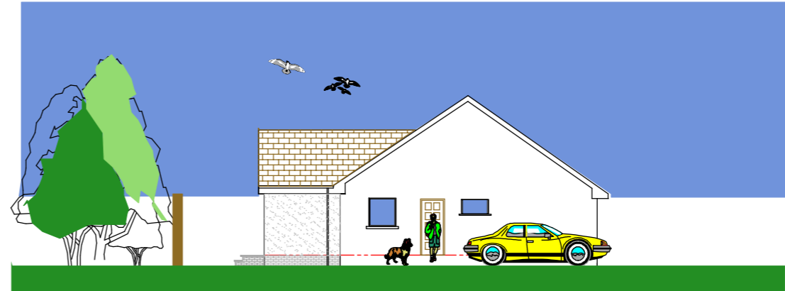
PROP SOUTH ELEV @ 1:200 @ A3