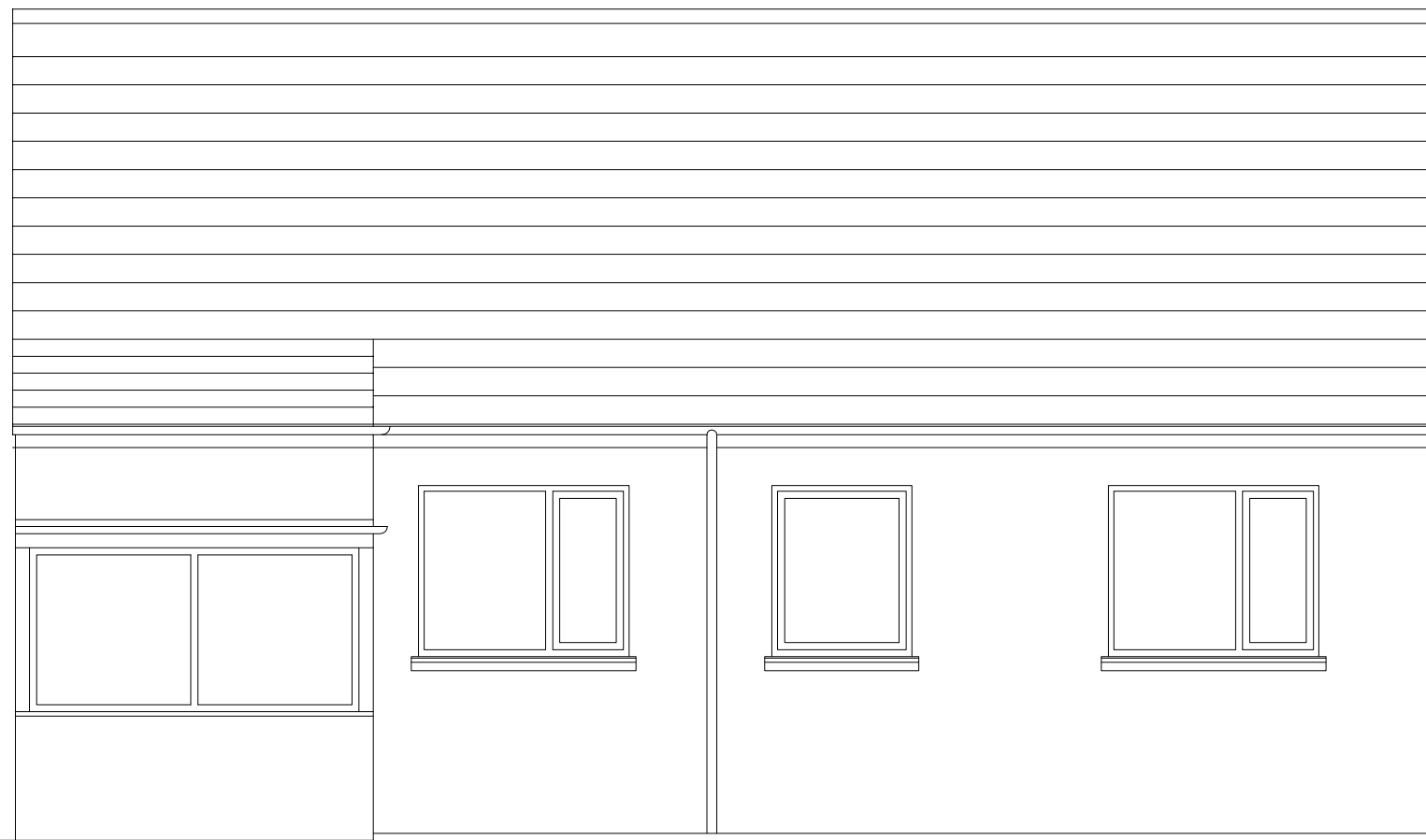
EXISTING SOUTH EAST ELEVATION

ALL DIMENSIONS AND LEVELS TO BE CHECKED ON SITE PRIOR TO THE COMMENCEMENT OF WORK. AGENT TO BE INFORMED OF ANY DISCREPANCIES PRIOR TO THE COMMENCEMENT OF WORK. UNLESS OTHERWISE SPECIFIED, ALL DIMENSIONS ARE TO BE SCALED OFF THE DRAWING. ALL DIMENSIONS ARE IN METRES UNLESS STATED OTHERWISE. IF ANY DIMENSIONS OR DETAILS CONFLICT PLEASE NOTIFY THE AGENT IMMEDIATELY. THIS DRAWING IS TO BE USED FOR STATUTORY PURPOSES ONLY. THIS IS NOT A CONSTRUCTION DRAWING.