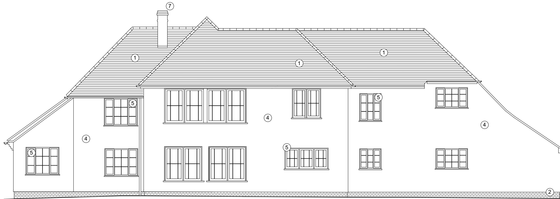
South East Elevation (rear)