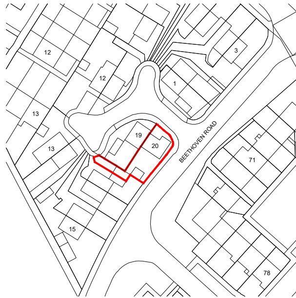
Site Location Plan Ordnance Survey 100053143