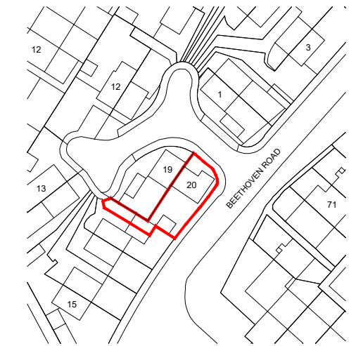
Site Location Plan (NTS) Ordnance Survey 100053143