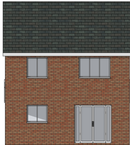
Existing Elevation - Rear