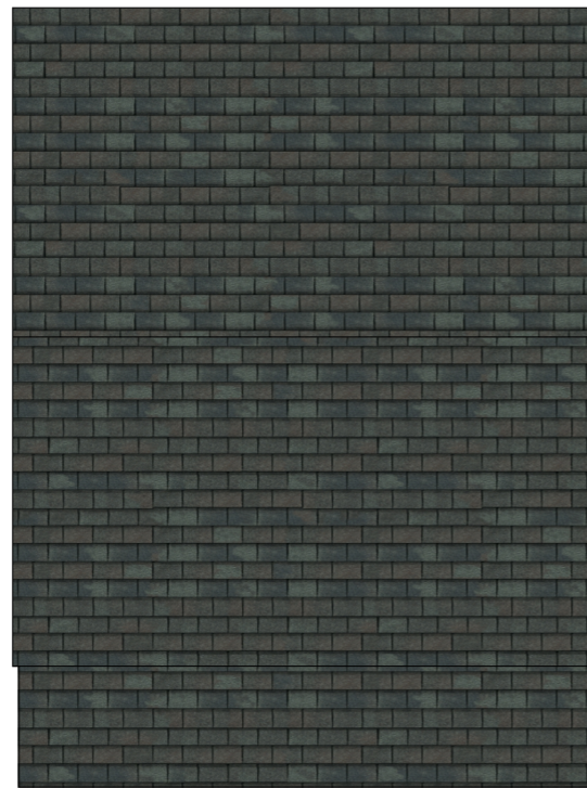
Existing Roof Plan