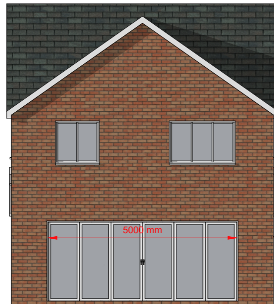
Proposed Elevation - Rear - Two Storey