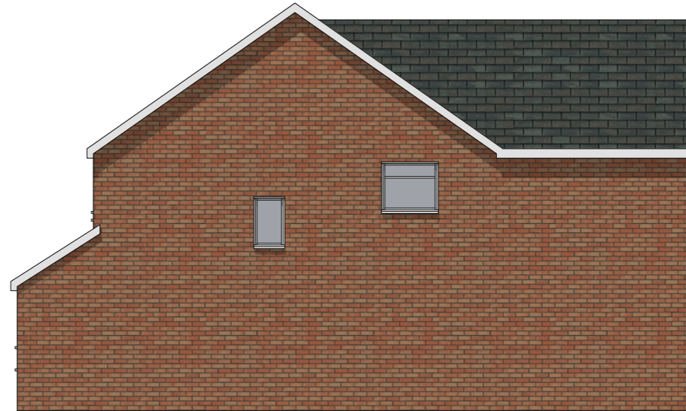
Proposed Elevation - RH Side - Two Storey