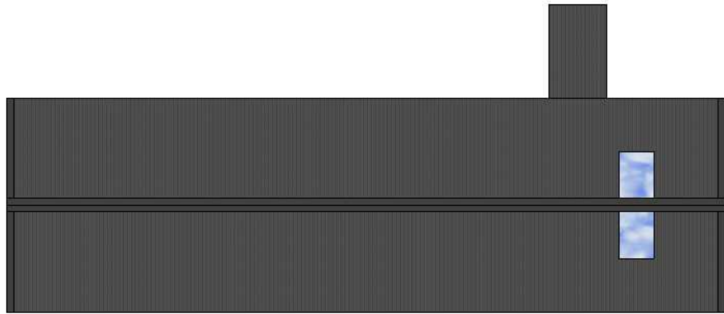
Proposed roof plan