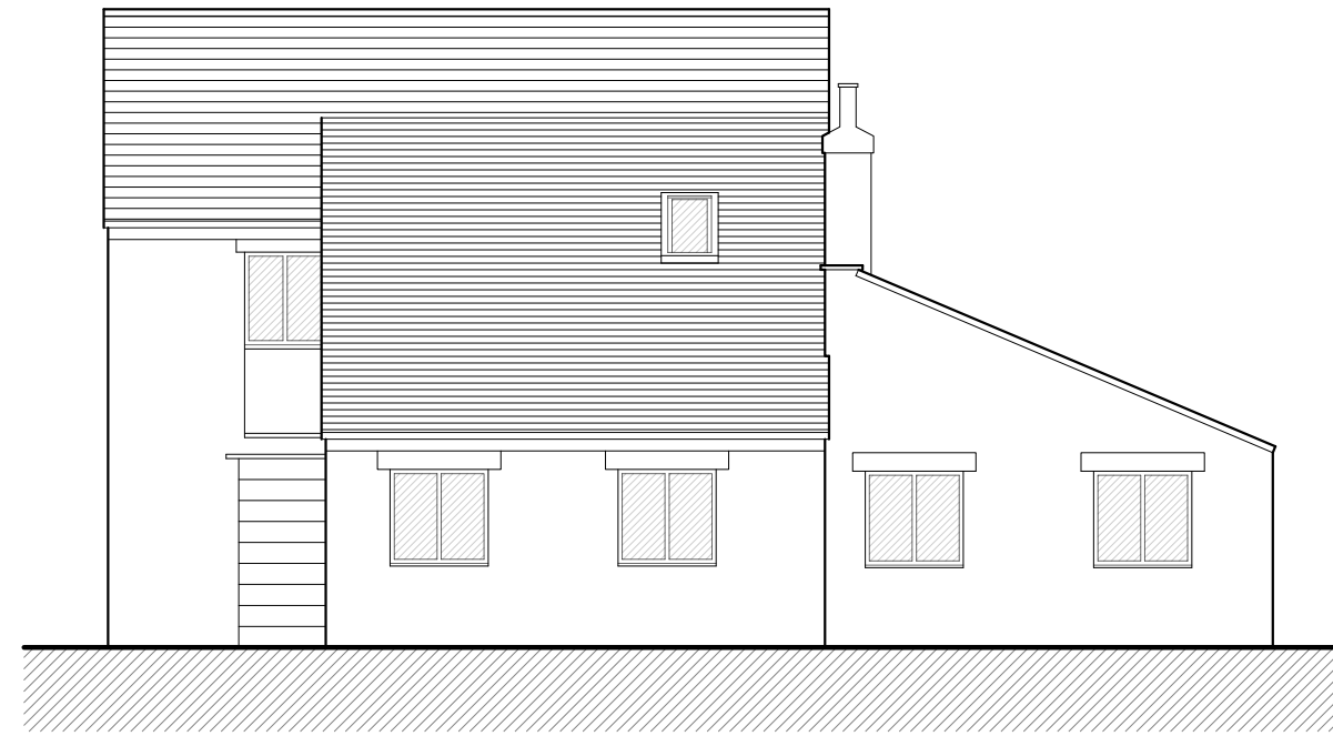
East Elevation - Existing