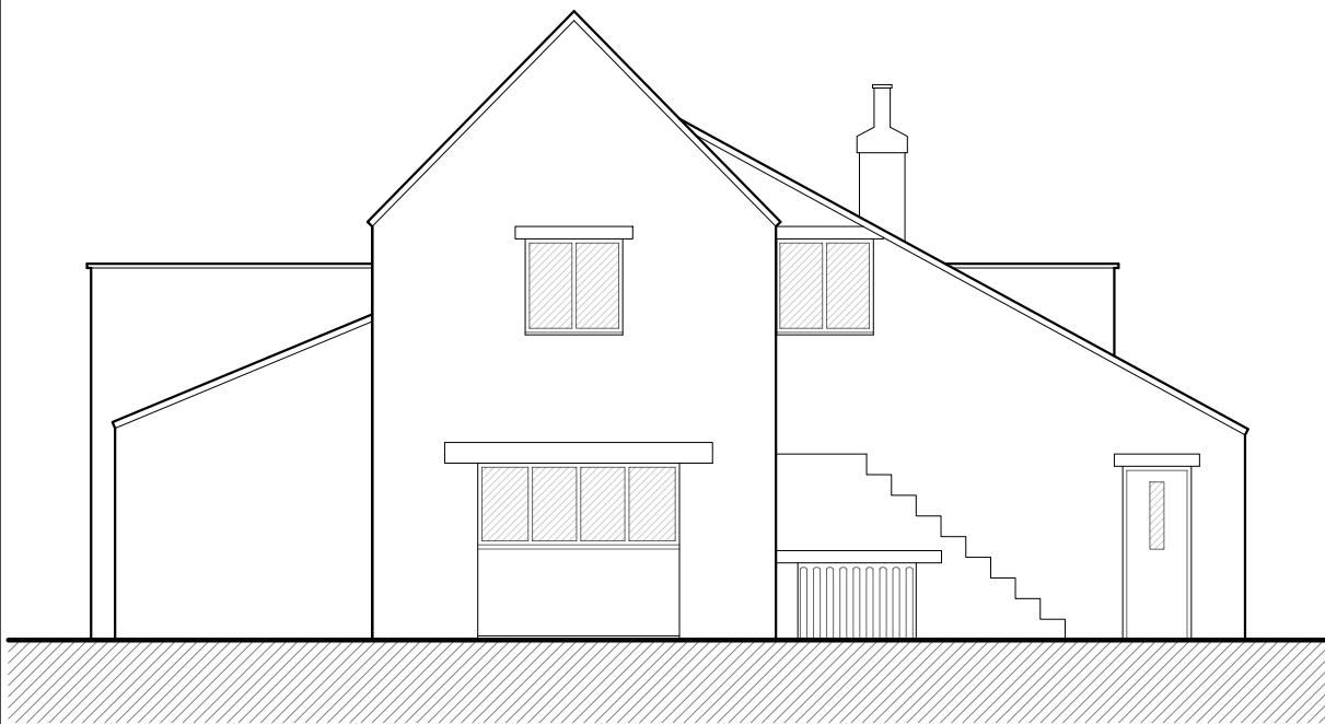
South Elevation - Existing