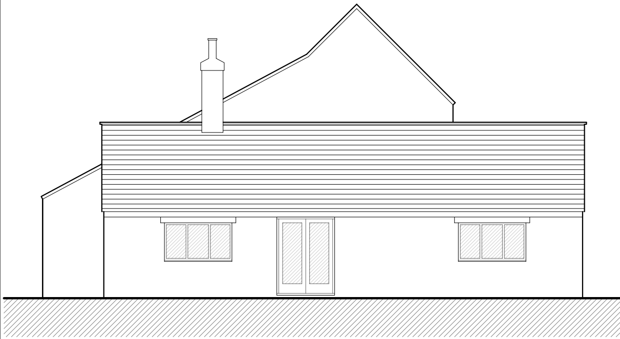
North Elevation - Existing