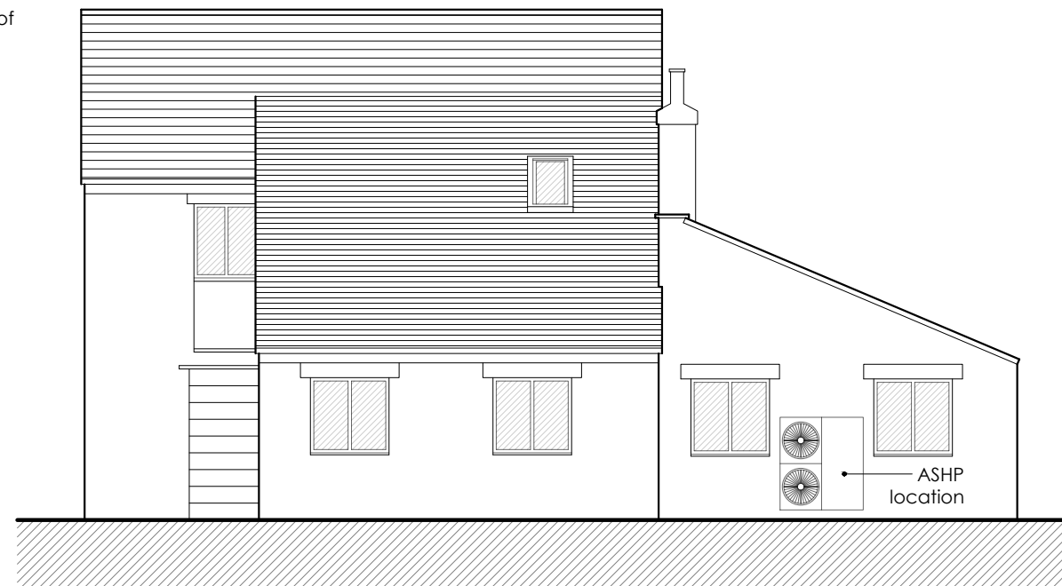
East Elevation - Proposed