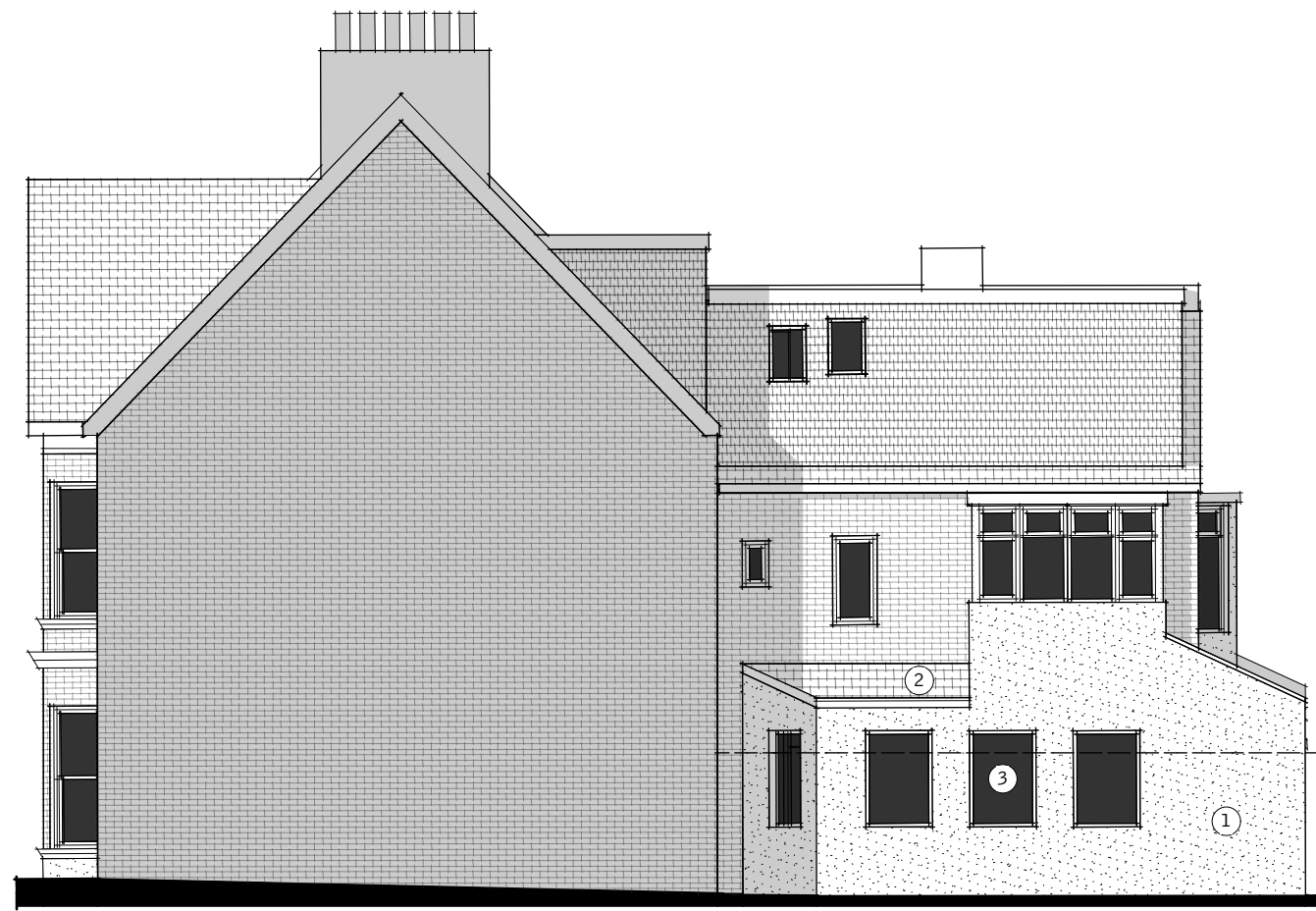
2 Side (north facing) elevation Scale: 1:100