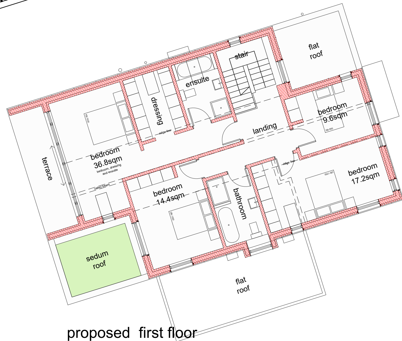
proposed first floor

30 Rosebery Road, New Alresford existing and proposed floor plans - first floor 1:100 at A3