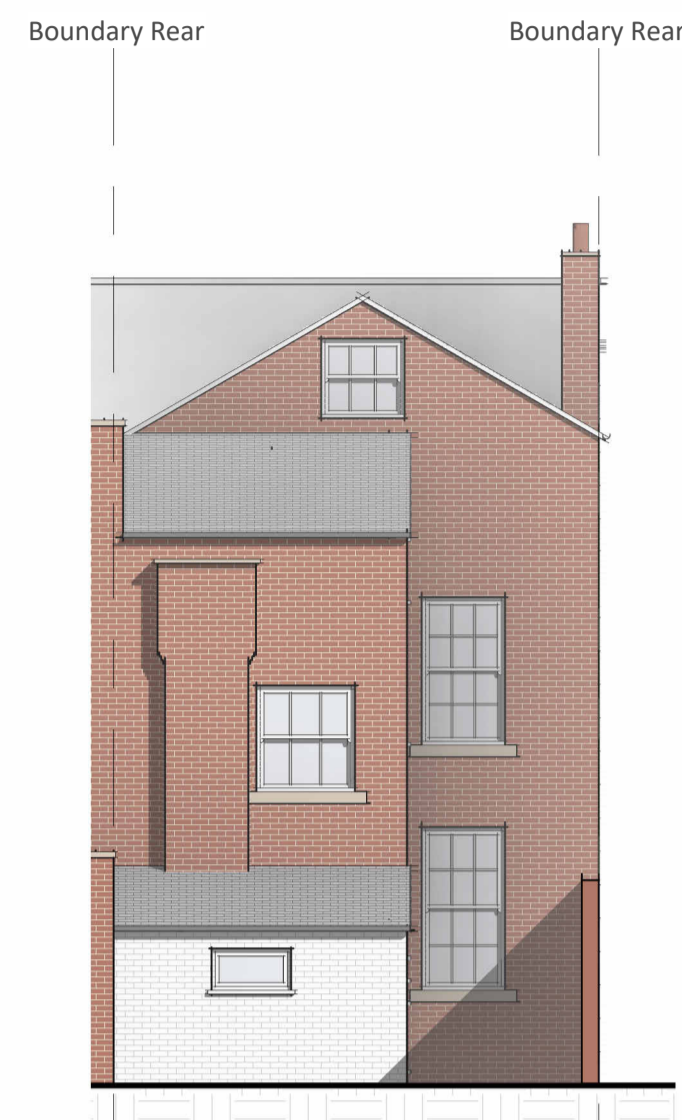
3 REAR 1 : 100