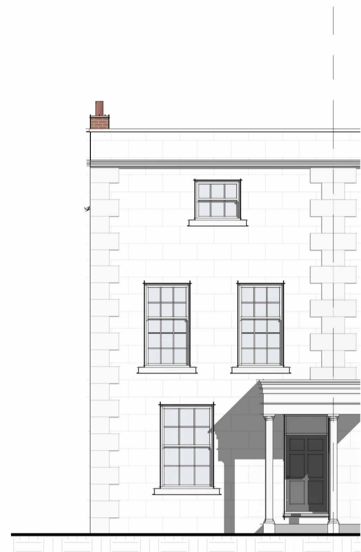
1 FRONT 1 : 100