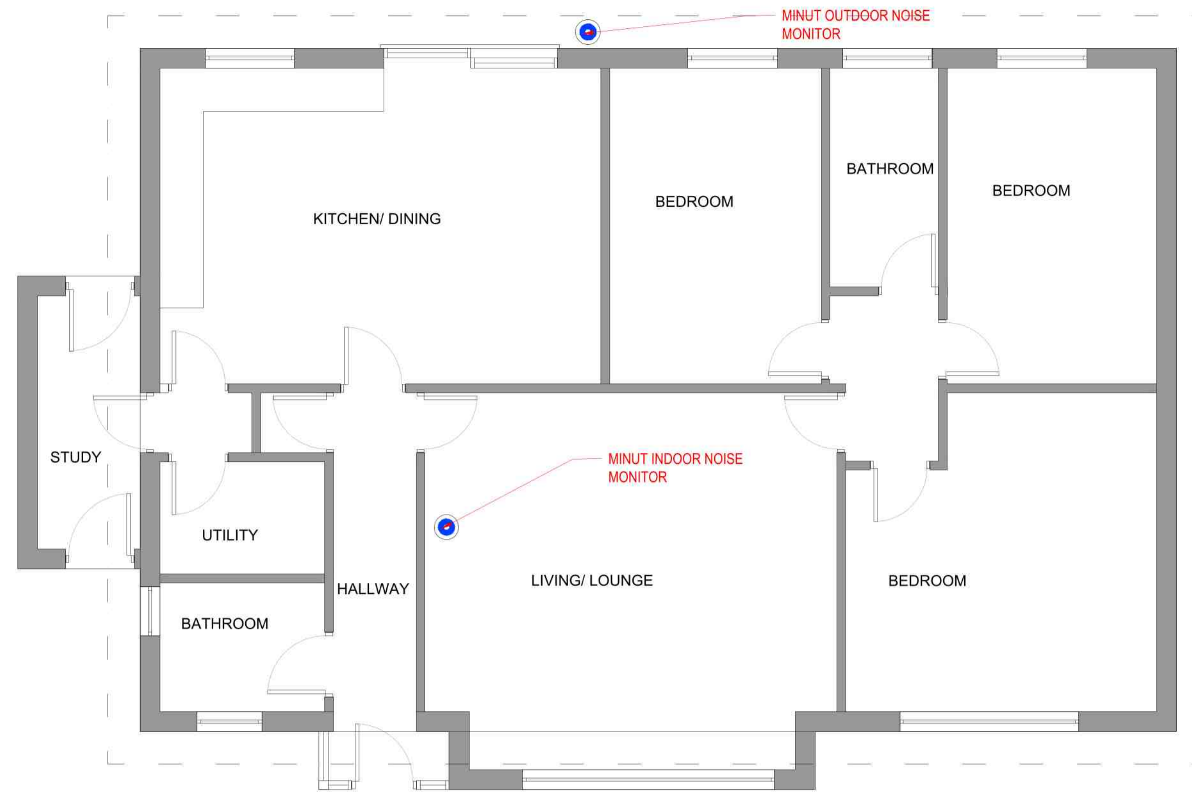
1 GROUND FLOOR PLAN SCALE 1:50