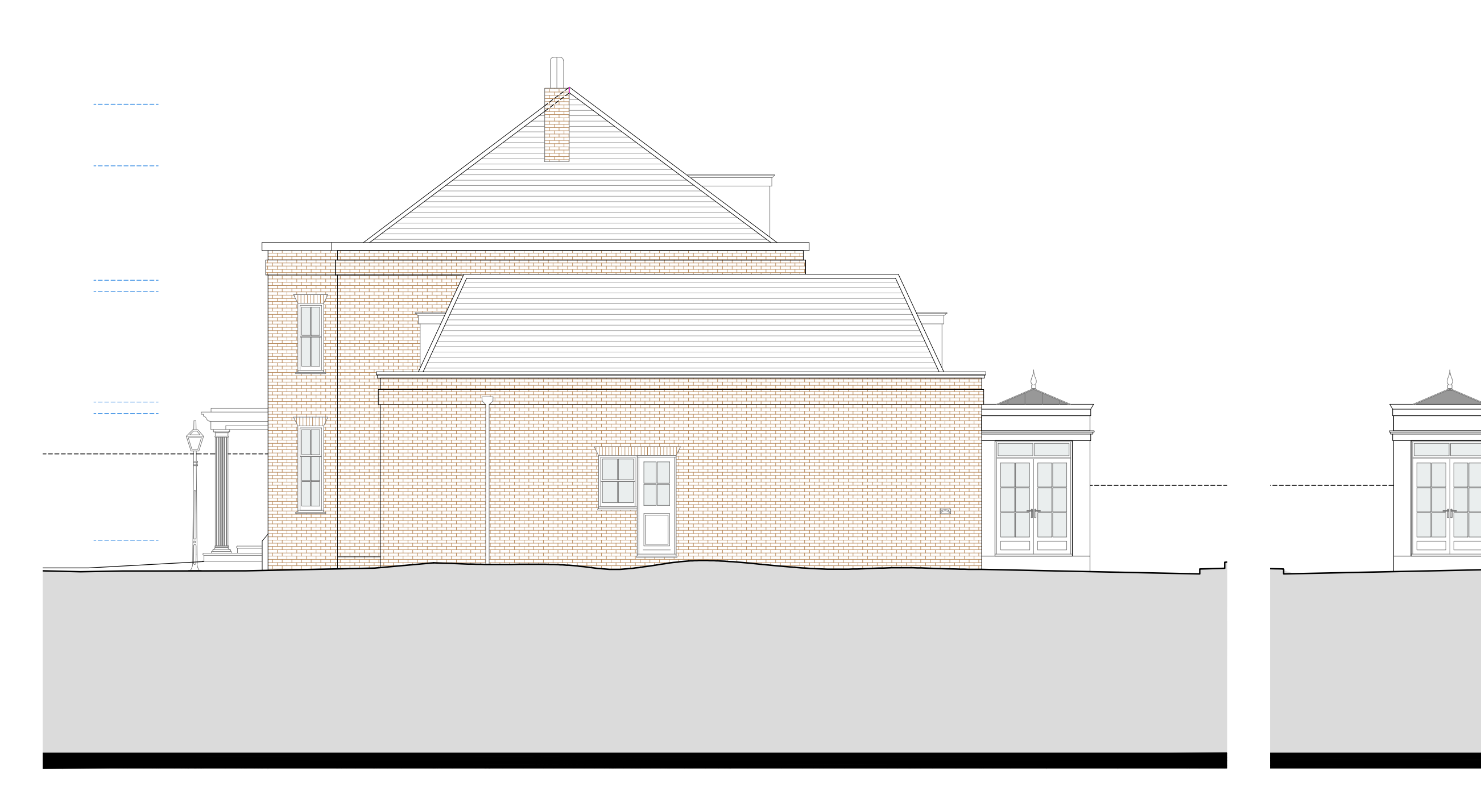
Proposed Side (North) Elevation