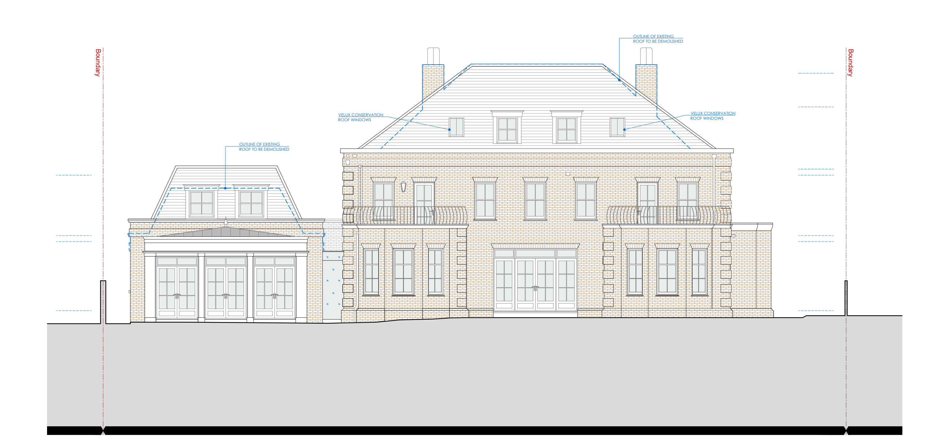
Proposed Rear (West) Elevation