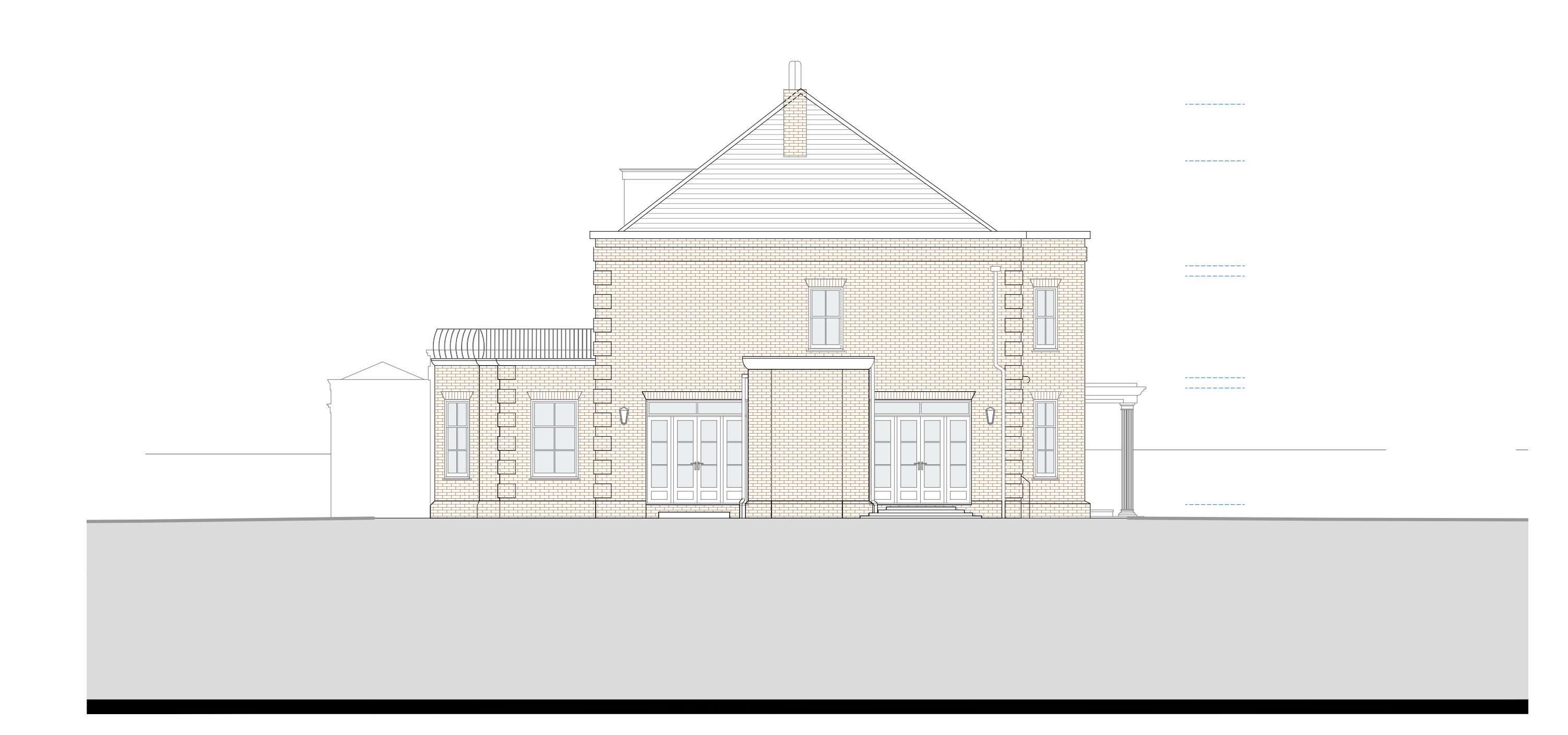
Proposed Side (South) Elevation