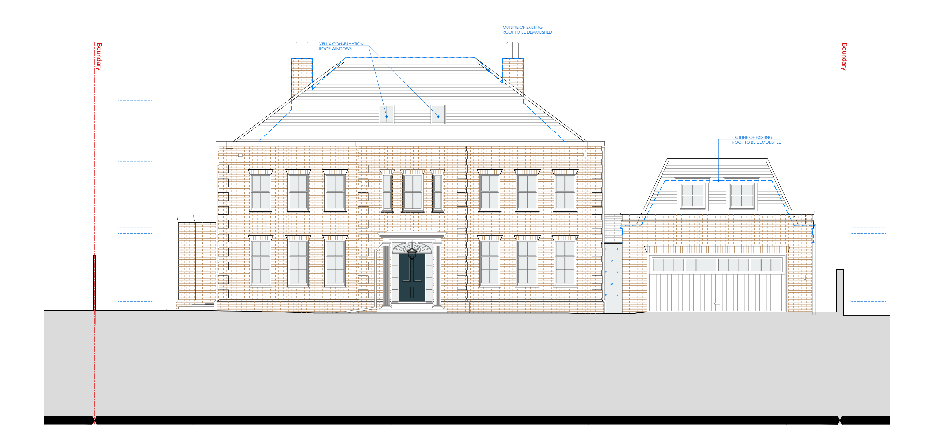
Proposed Front (East) Elevation