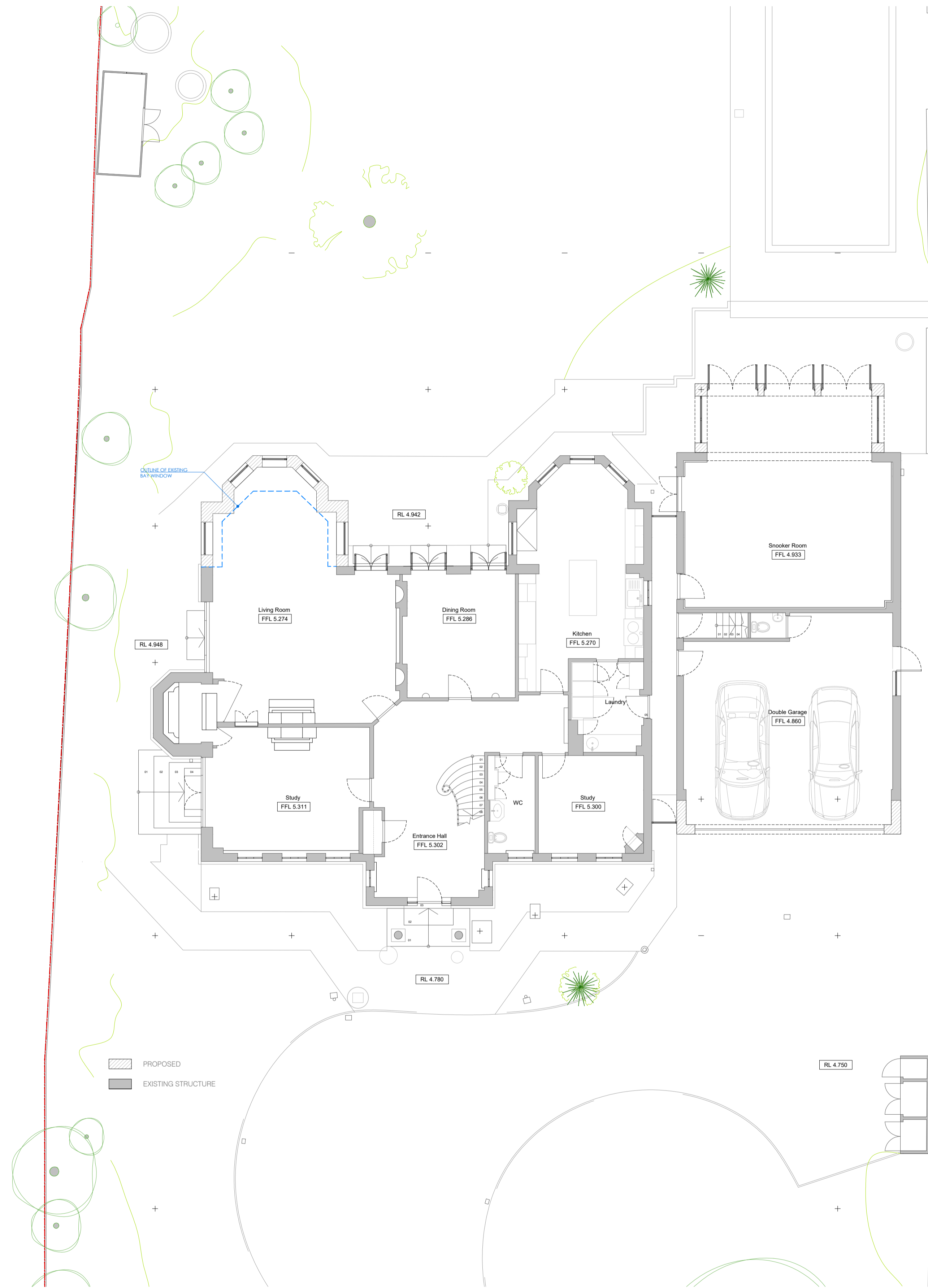
Proposed Ground Floor Plan