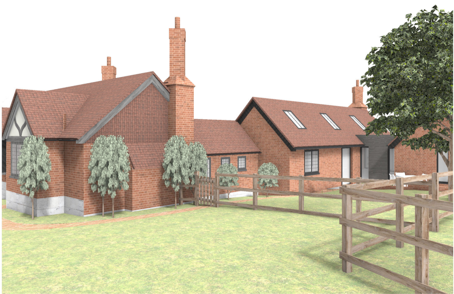
V3 PERSPECTIVE VIEW: LOOKING NORTH TOWARDS HOUSE Scale: N/A