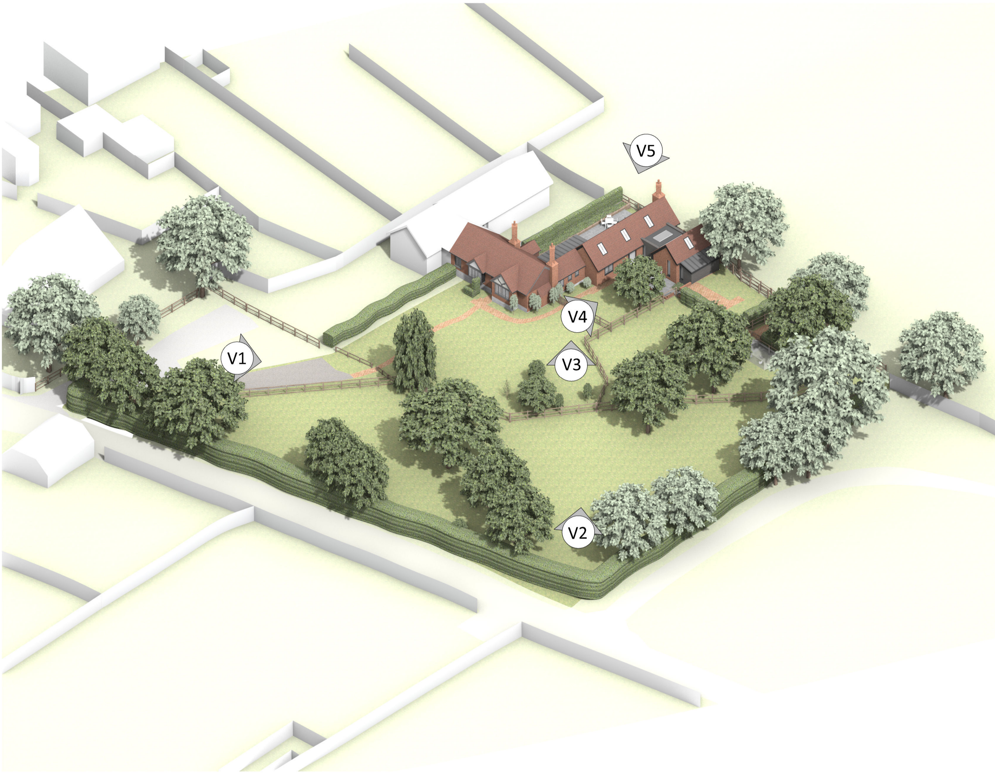
00 AXONOMETRIC Scale: 1:250 @ A1

NOTE: PLANNING PERMISSION IS REQUIRED FOR DEMOLITION OF ALL OR PART OF A BUILDING SET WITHIN A CONSERVATION AREA, TO PROCEED OTHERWISE IS A CRIMINAL OFFENCE.