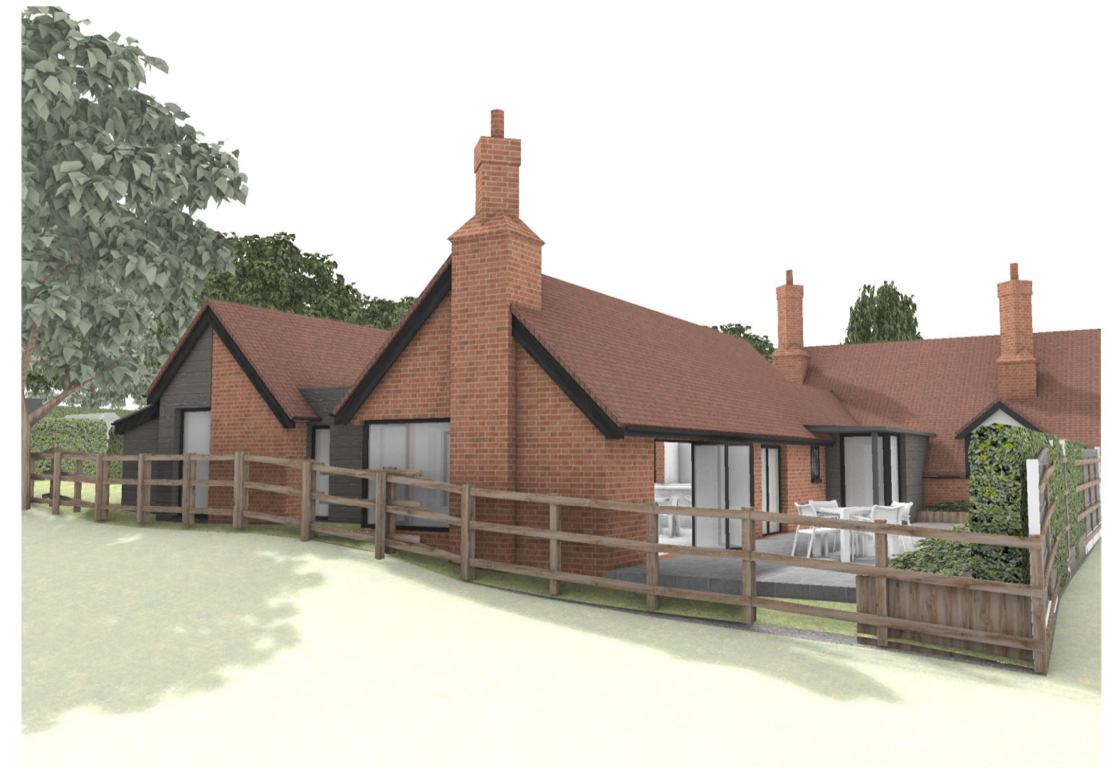
V5 PERSPECTIVE VIEW: LOOKING SOUTH WEST TOWARDS REAR OF EXTENSION Scale: N/A