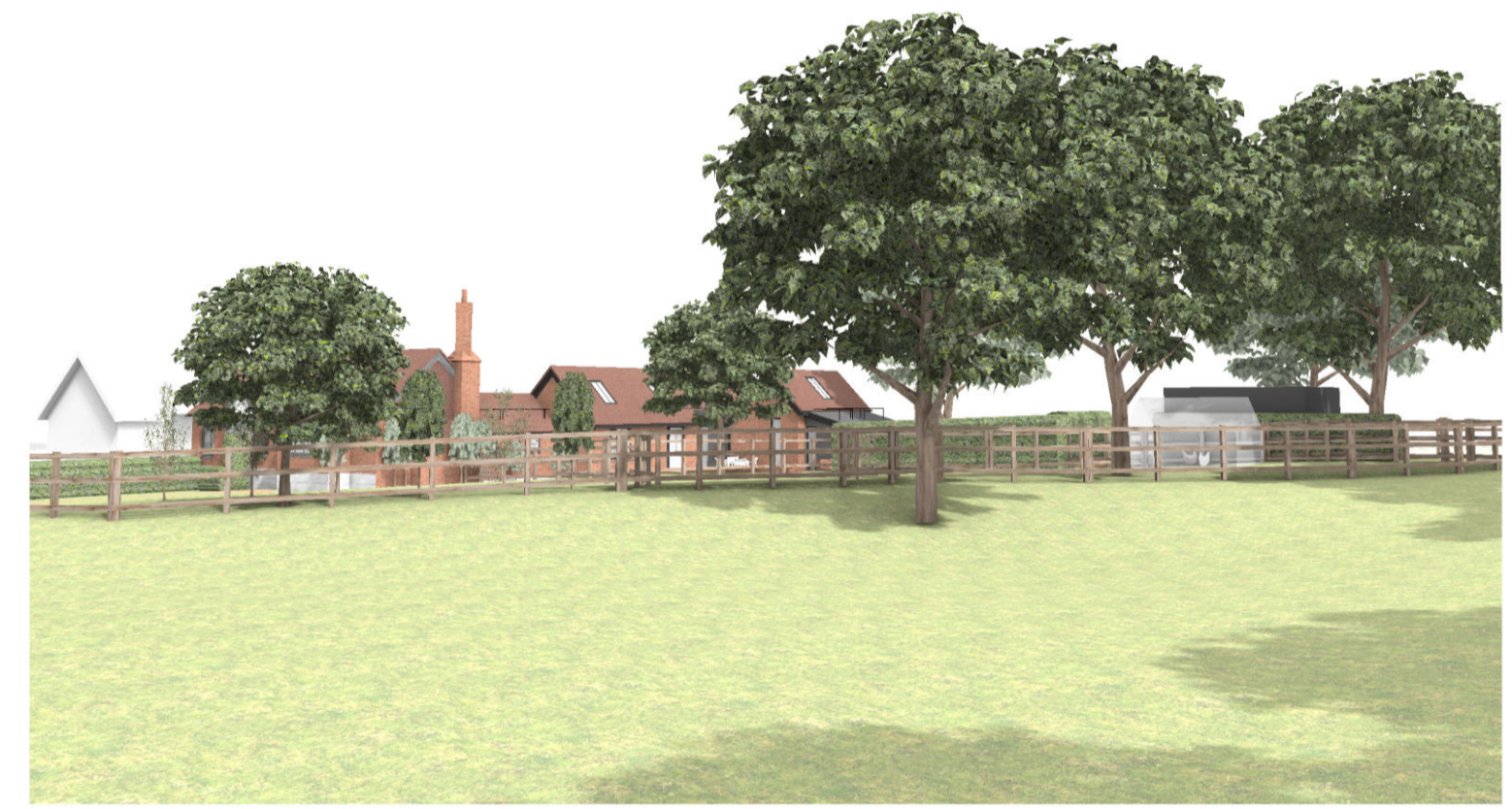
V2 PERSPECTIVE VIEW: FROM SOUTHERN CORNER OF FIELD Scale: N/A