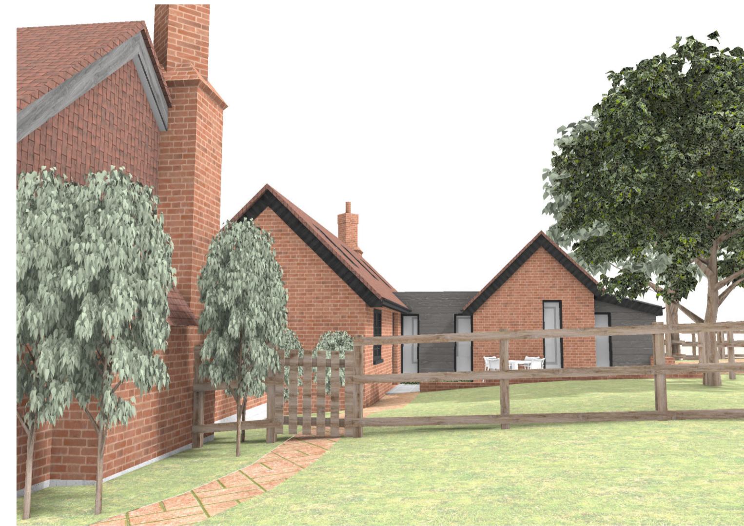
V4 PERSPECTIVE VIEW: LOOKING NORTH EAST TOWARDS FRONT OF EXTENSION Scale: N/A