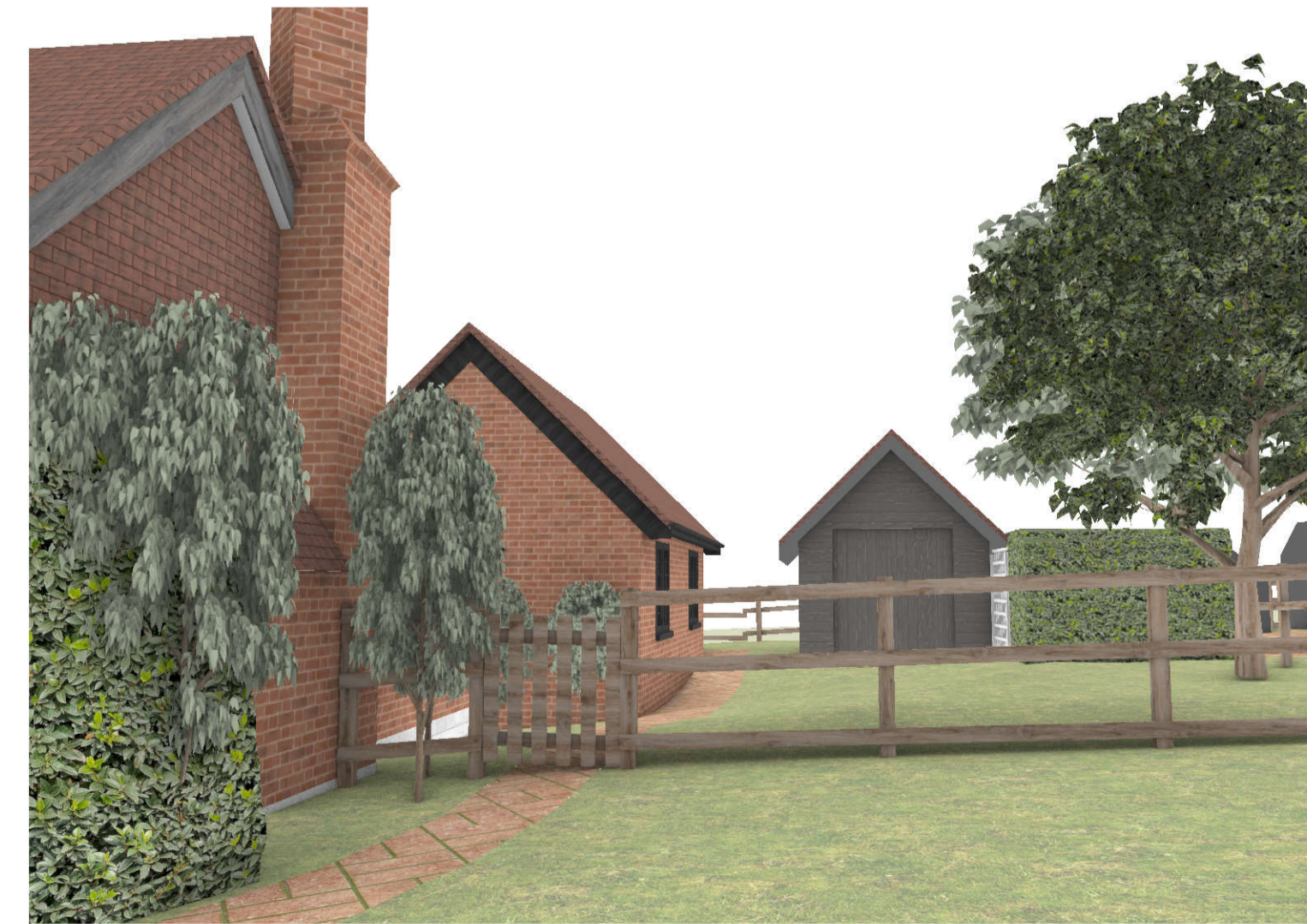
V4 PERSPECTIVE VIEW: LOOKING NORTH EAST AT SIDE OF HOUSE Scale: N/A