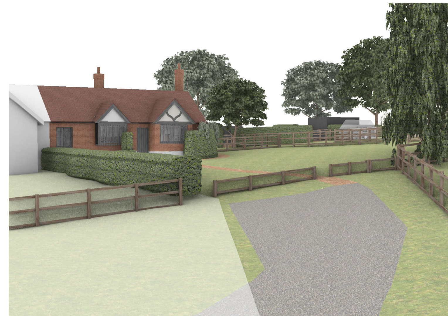
V1 PERSPECTIVE VIEW: FROM SITE ENTRANCE Scale: N/A