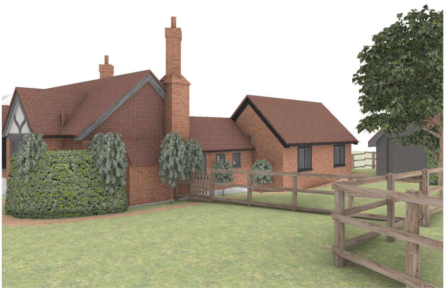
V3 PERSPECTIVE VIEW: LOOKING NORTH TOWARDS HOUSE Scale: N/A