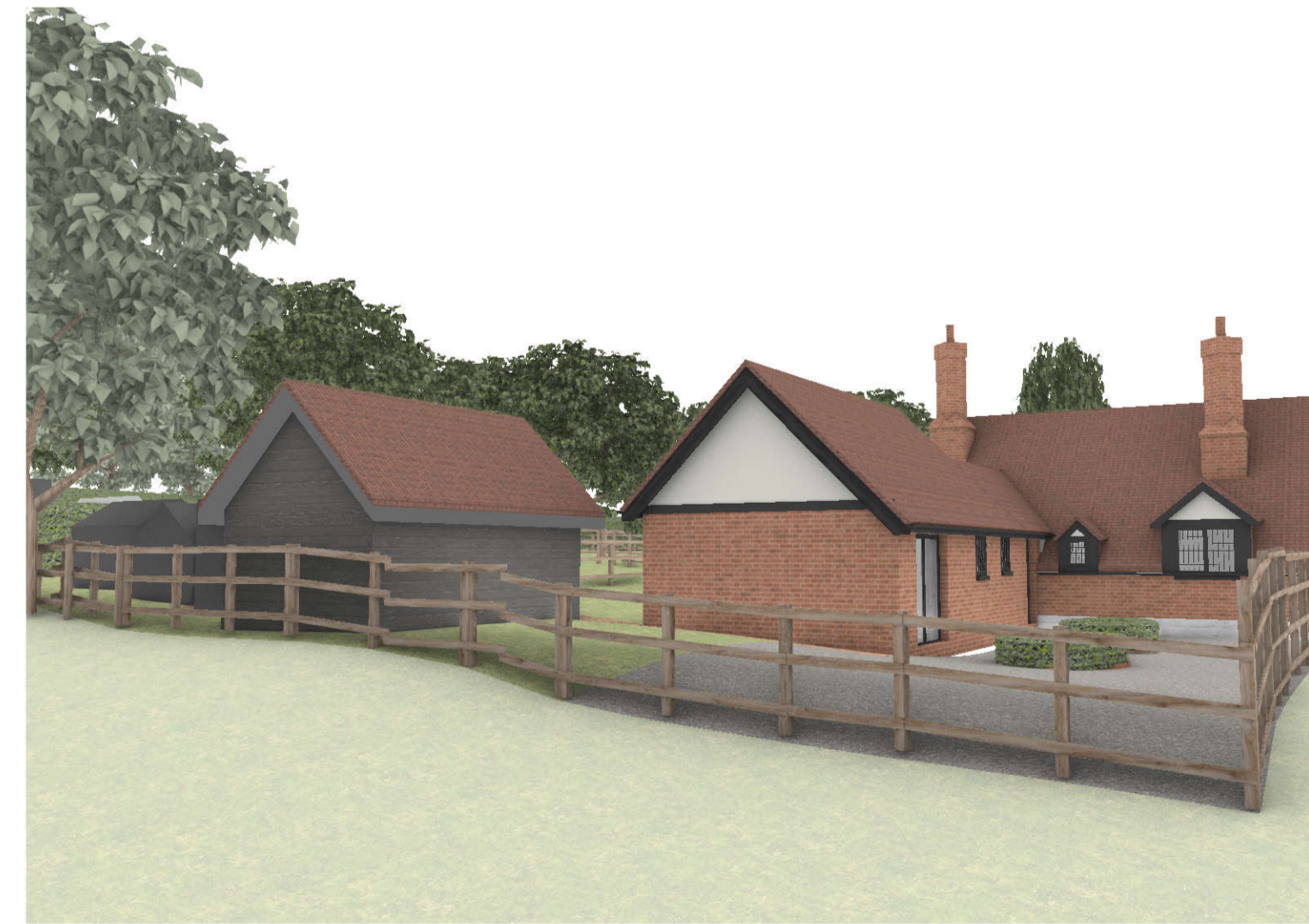
V5 PERSPECTIVE VIEW: LOOKING SOUTH WEST TOWARDS REAR OF HOUSE Scale: N/A