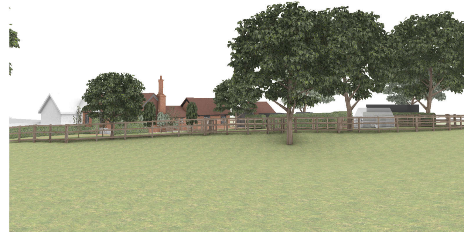
V2 PERSPECTIVE VIEW: TOWARDS OUTBUILDINGS Scale: N/A