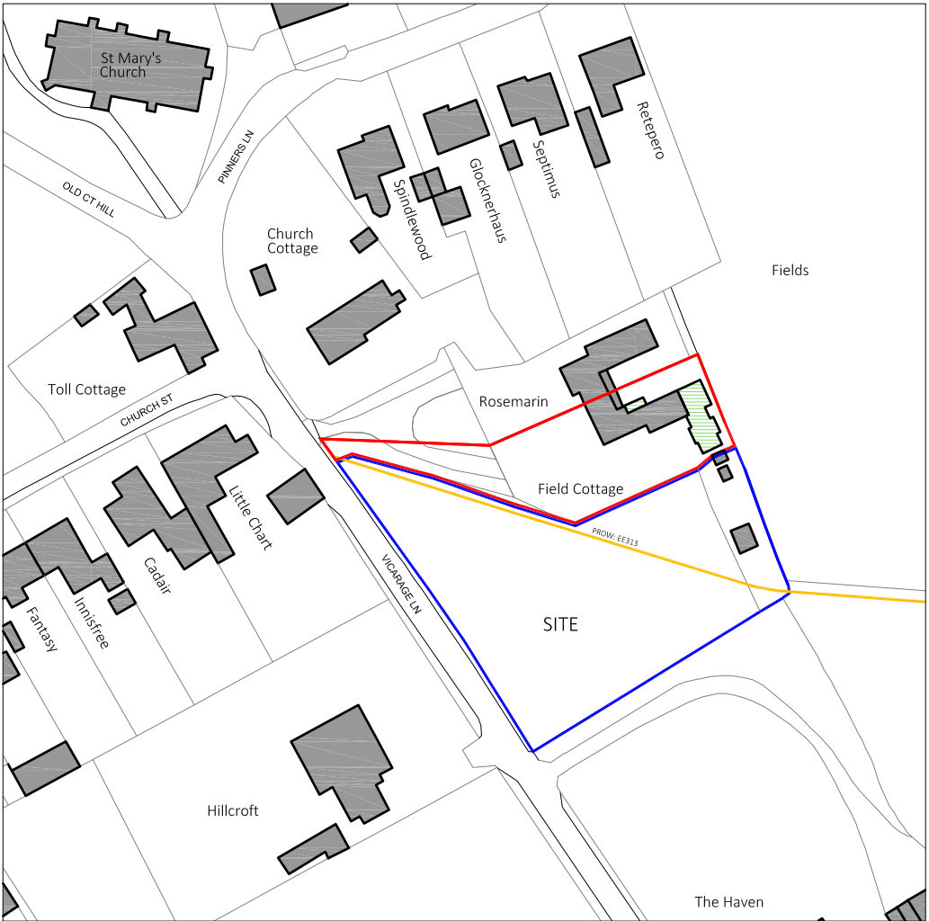
01 SITE O.S. LOCATION PLAN Scale: 1:1250 @ A3