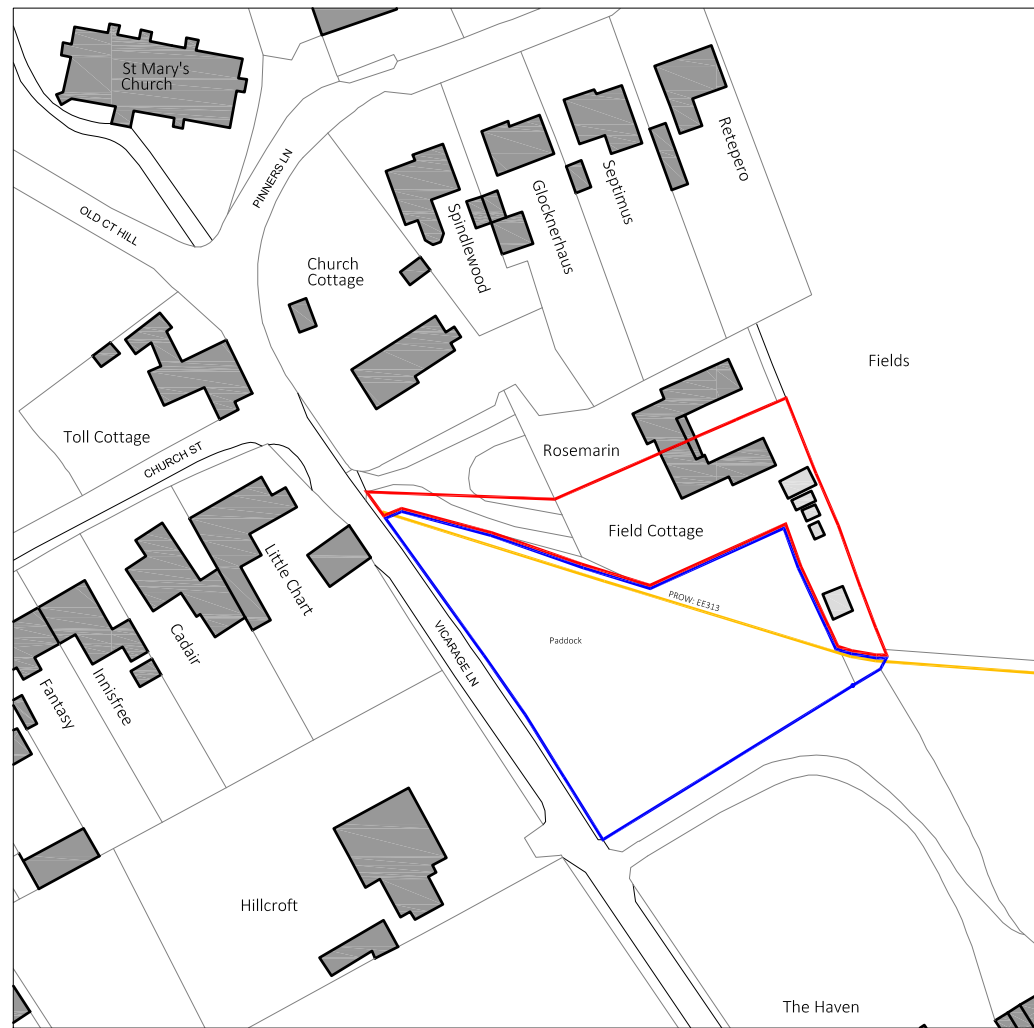
01 SITE O.S. LOCATION PLAN Scale: 1:1250 @ A3