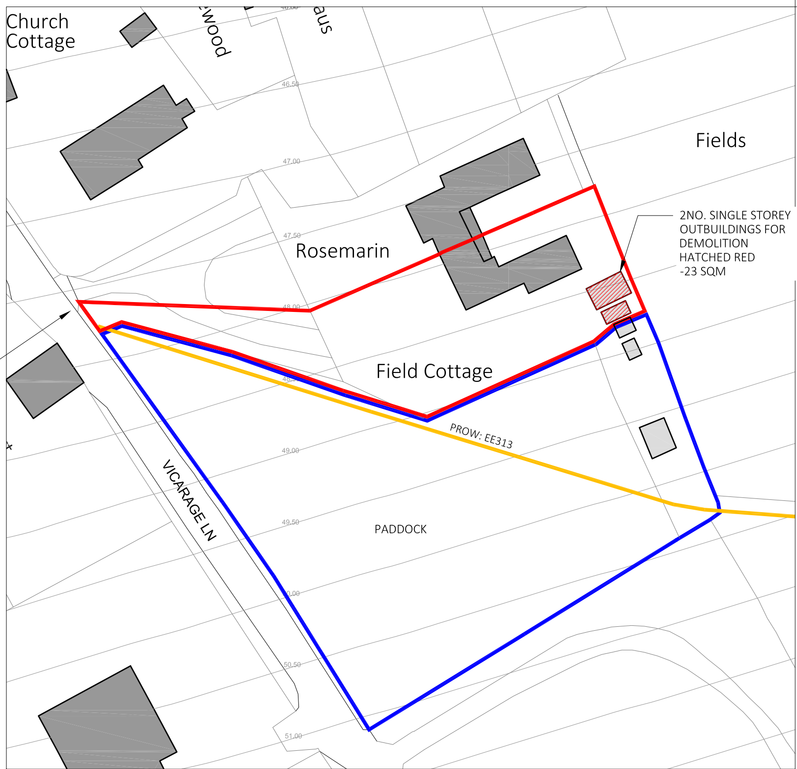
02 SITE BLOCK PLAN Scale: 1:500 @ A3