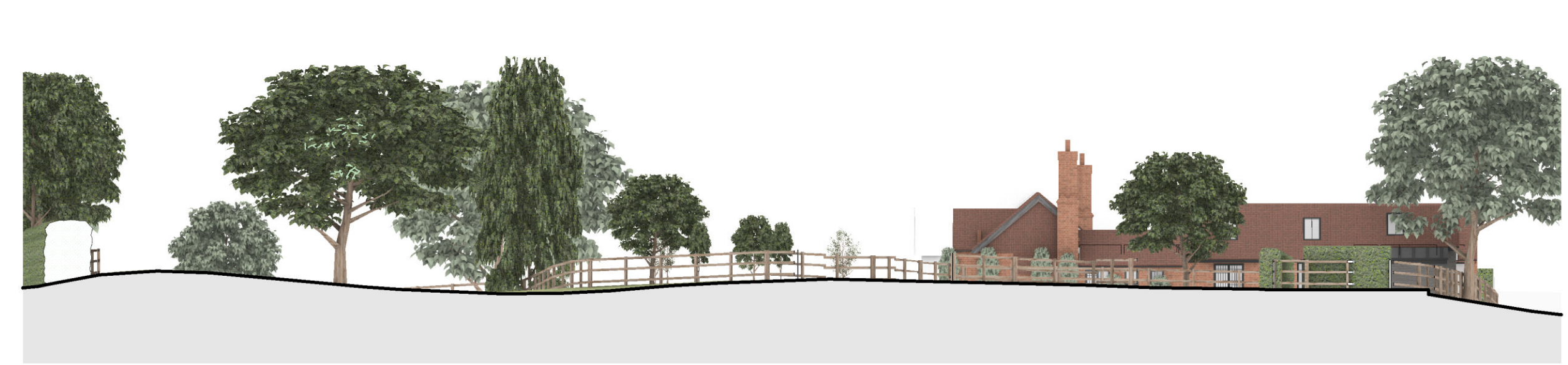
03 SECTION BB Scale: 1:250 @ A1