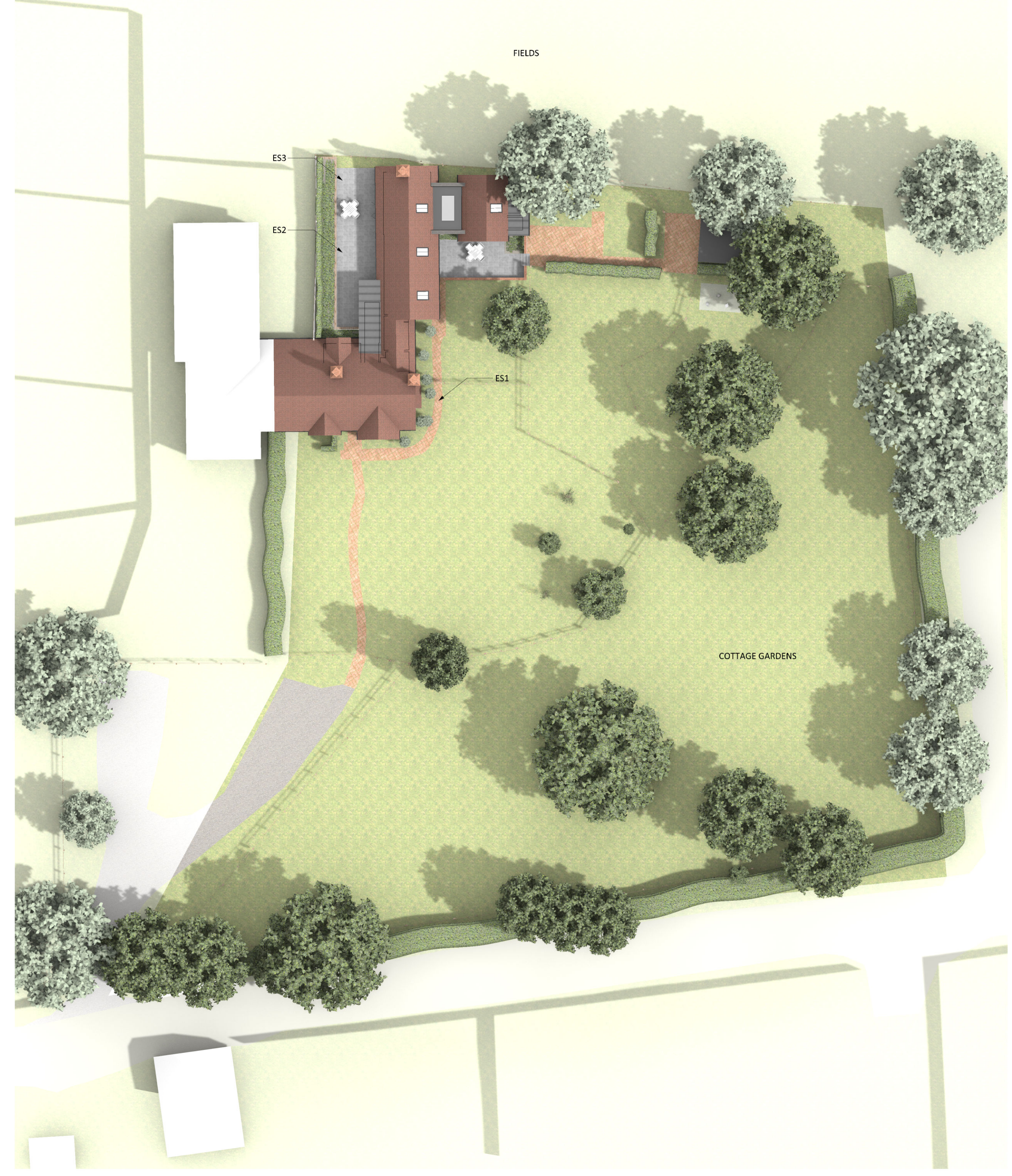
01 SITE PLAN - BIRDS EYE Scale: 1:250 @ A1