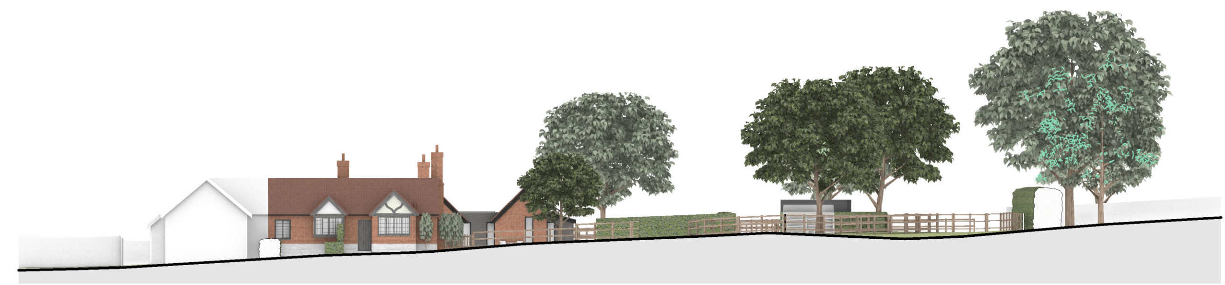
02 SECTION AA Scale: 1:250 @ A1