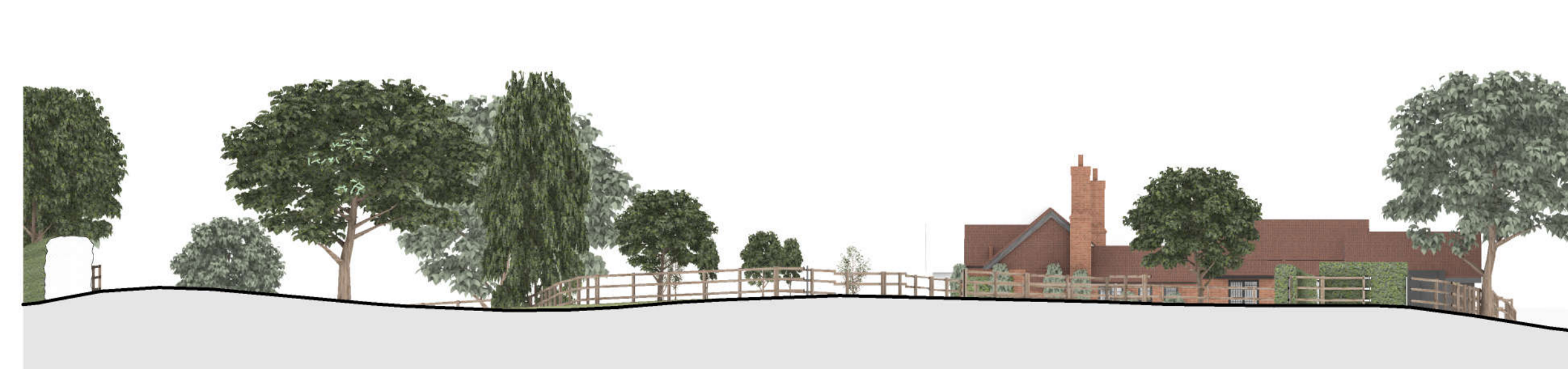
03 SECTION BB Scale: 1:250 @ A1