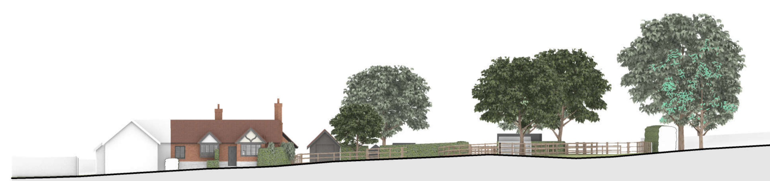
02 SECTION AA Scale: 1:250 @ A1