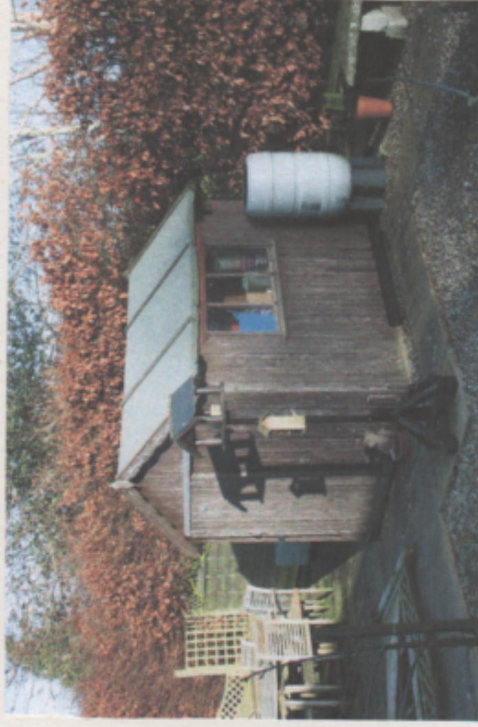
Existing Shed to be replaced

West Byre, Bowes, Barnard Castle Alterations to windows, doors and garden structures Proposed Shed Details Scale 1:20 @A3. January 2024 Drawing No. 07/25/2023