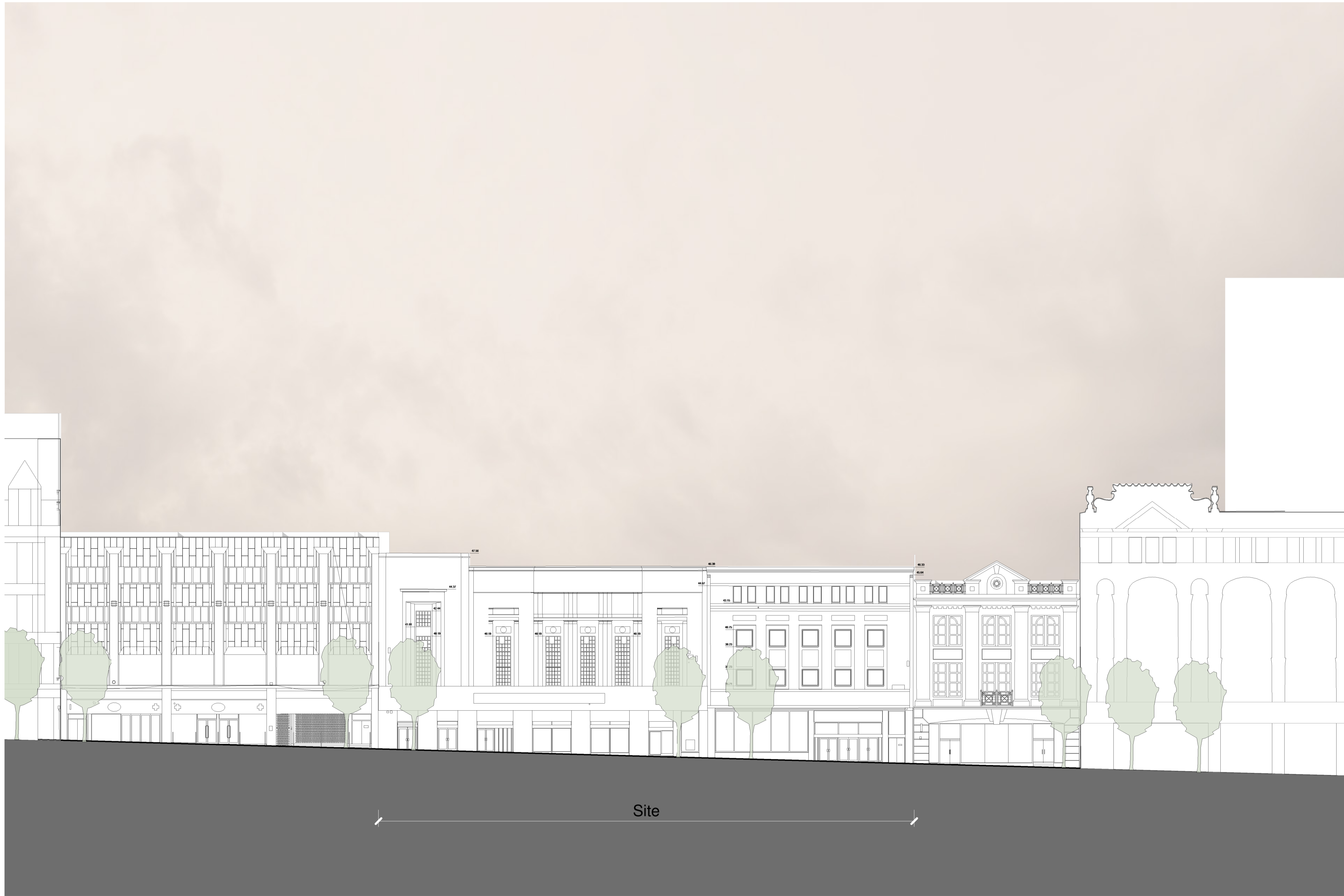
1 Elevation A - Sauchiehall Street 1 : 200