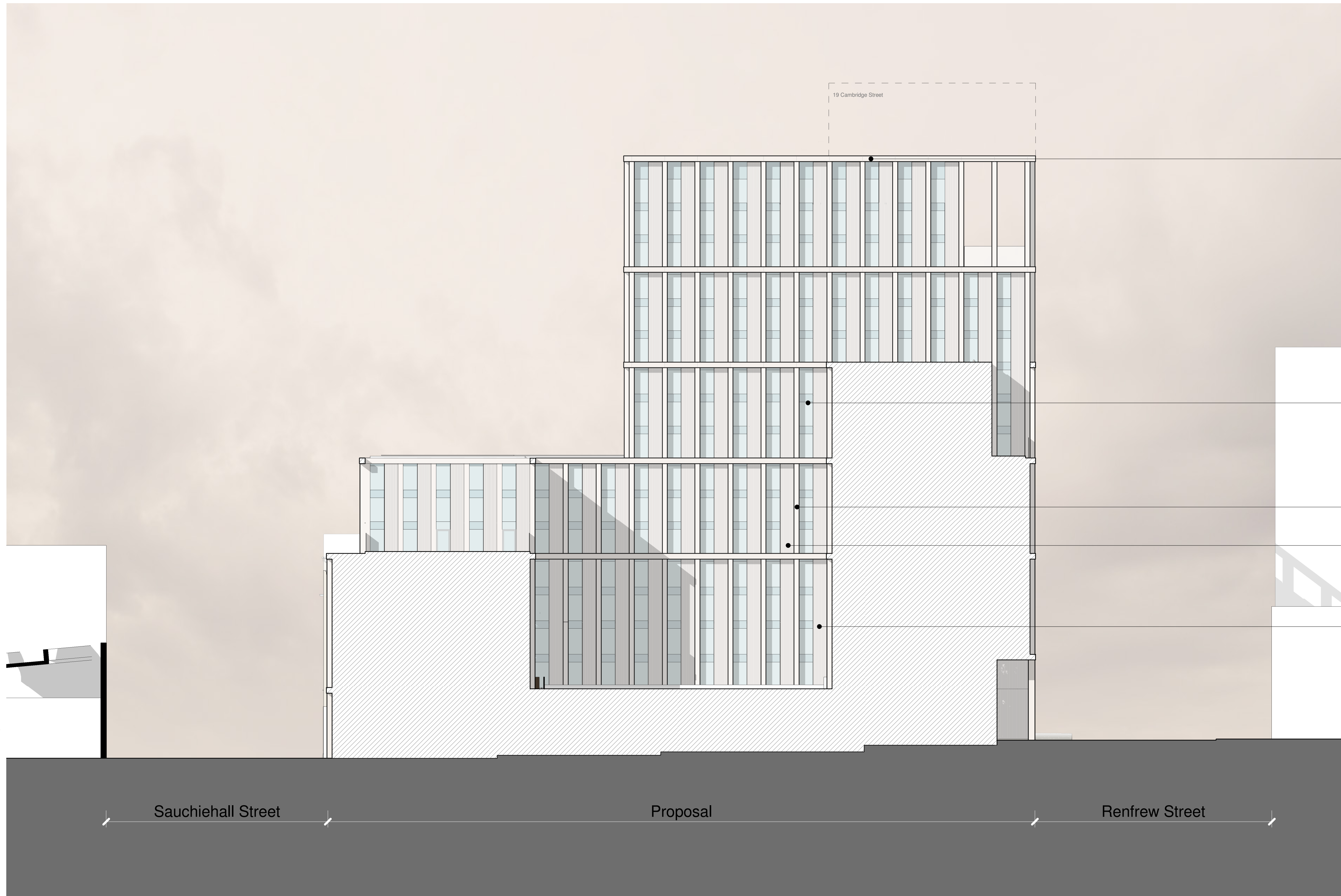
1 Elevation - East - Courtyard 1 : 200