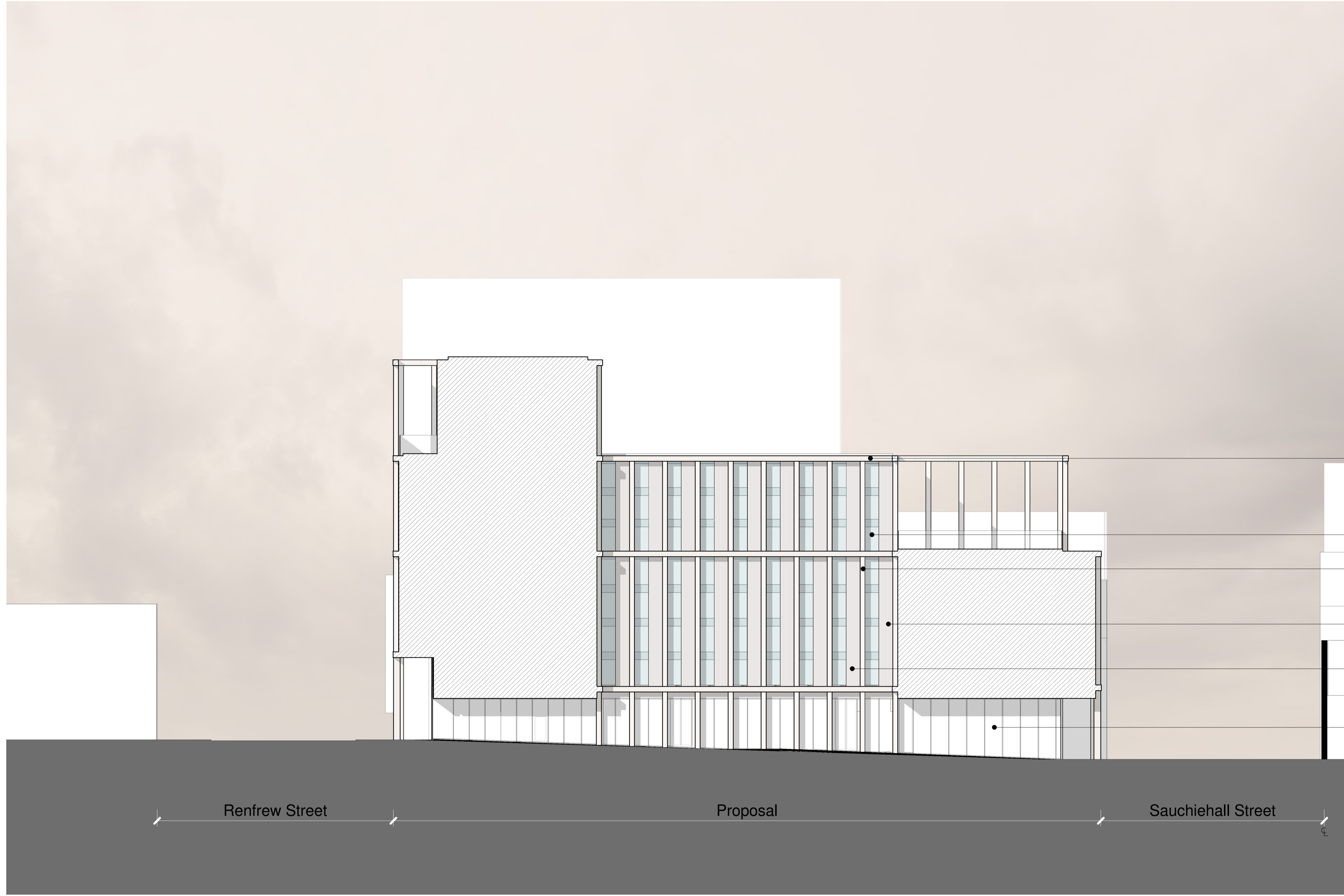
1 Elevation - West - Courtyard 1 : 200