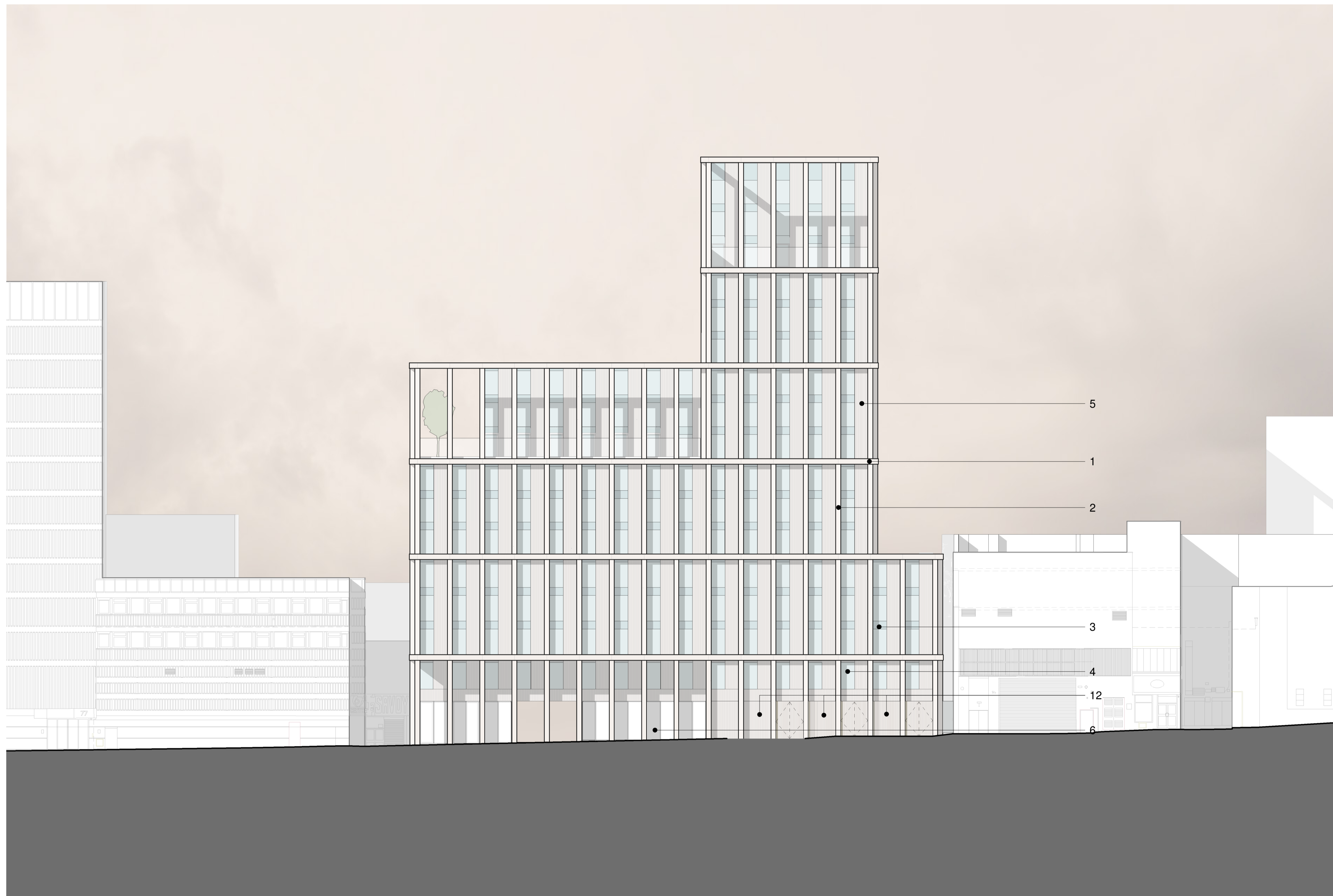
1 Elevation - North - Renfrew Street 1 : 200