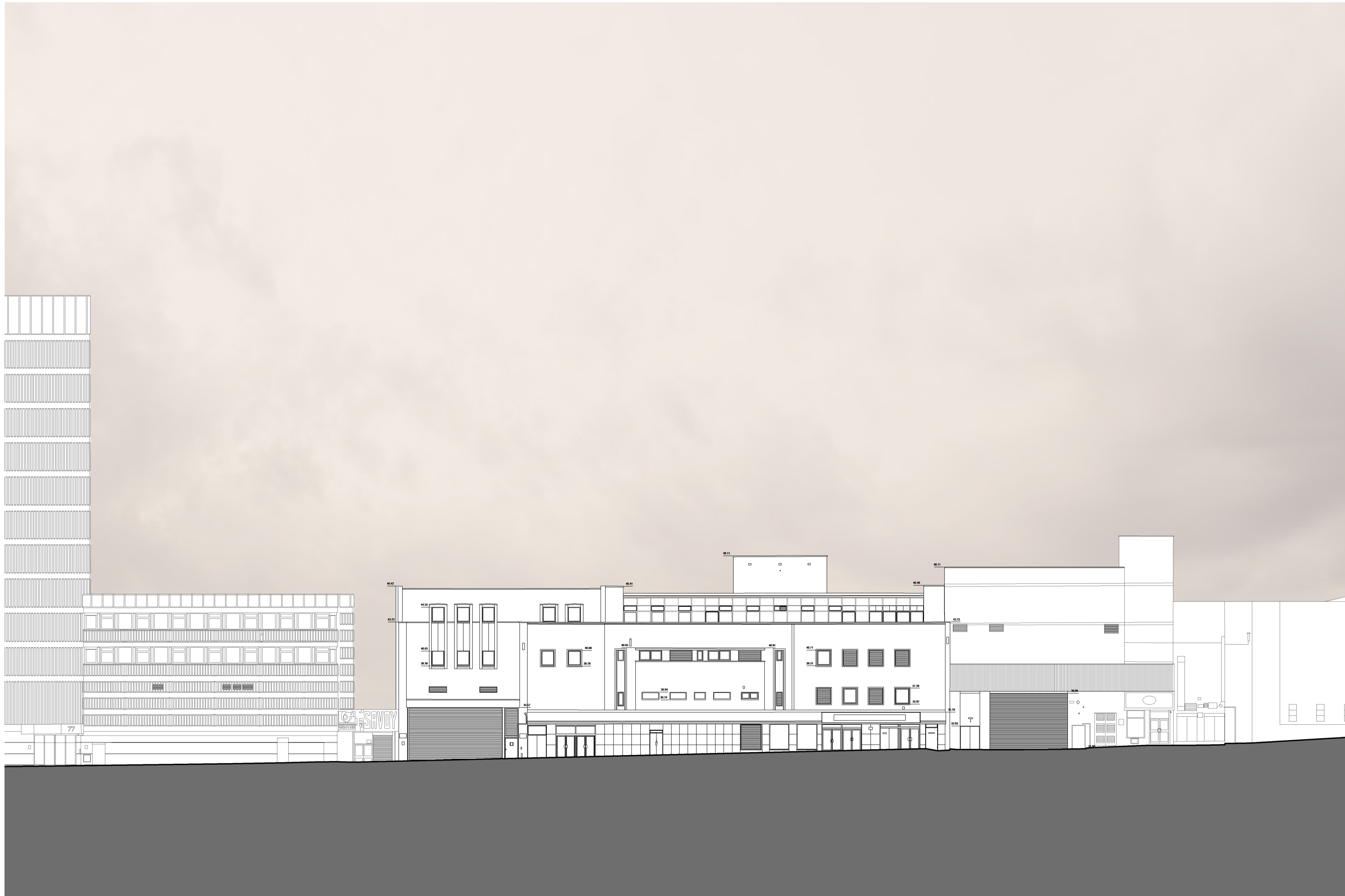
① Elevation B - Renfrew Street 1 : 200