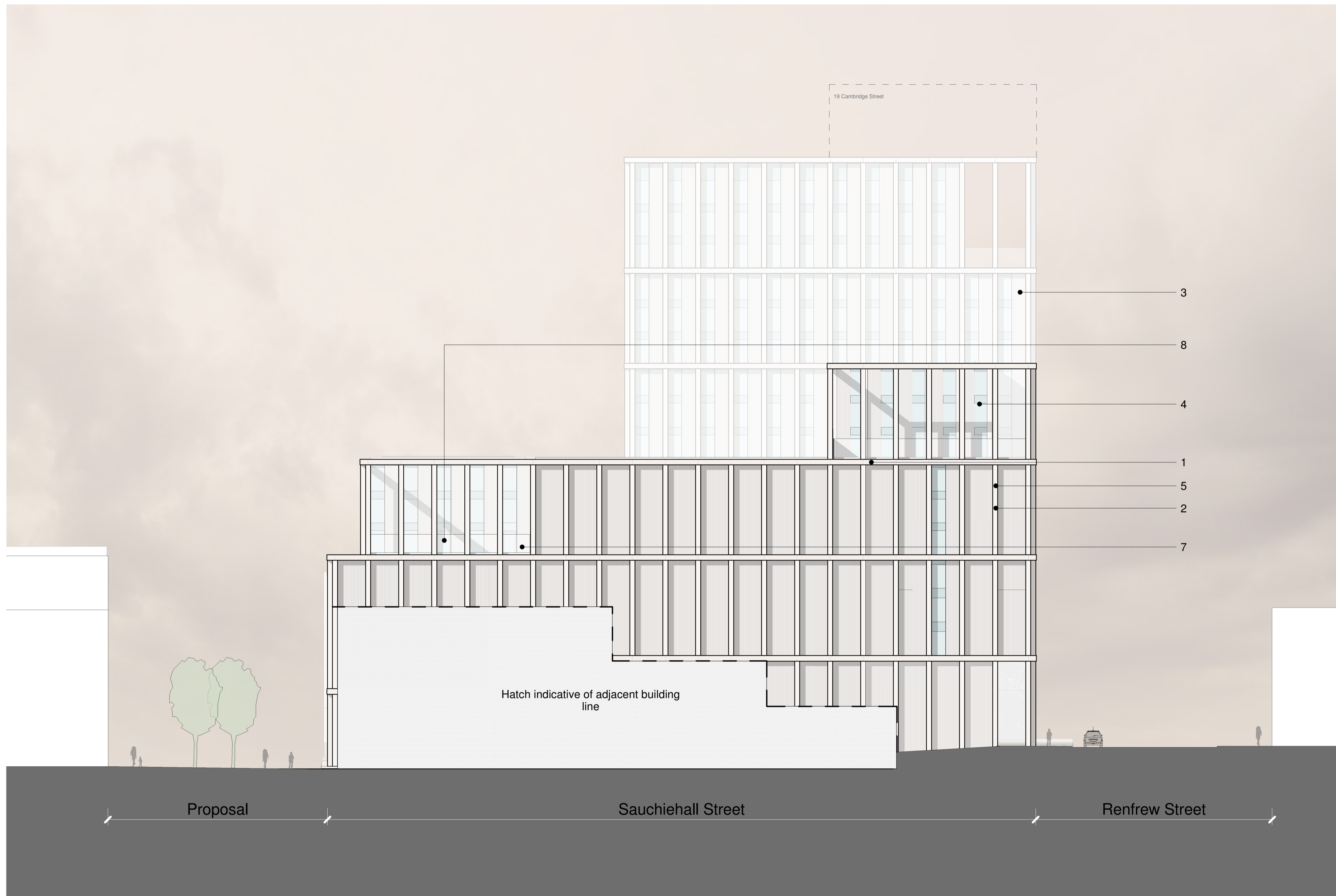
1 Elevation - East 1 : 200