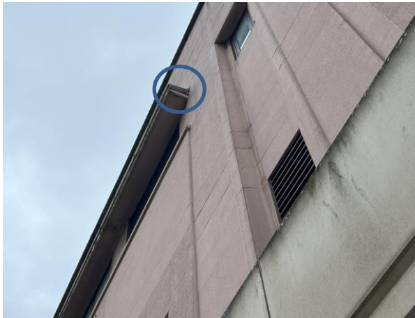
Photo 3: PRF- loose roofing felt on ledge, in the northern aspect.