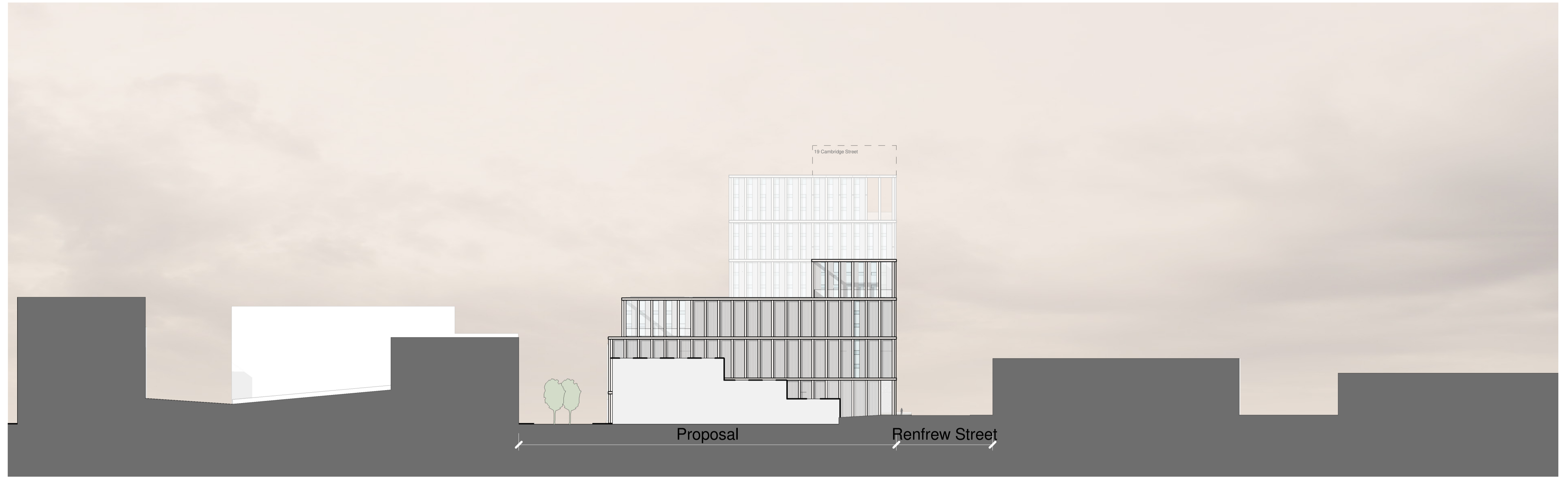
① East Elevation 1 : 500