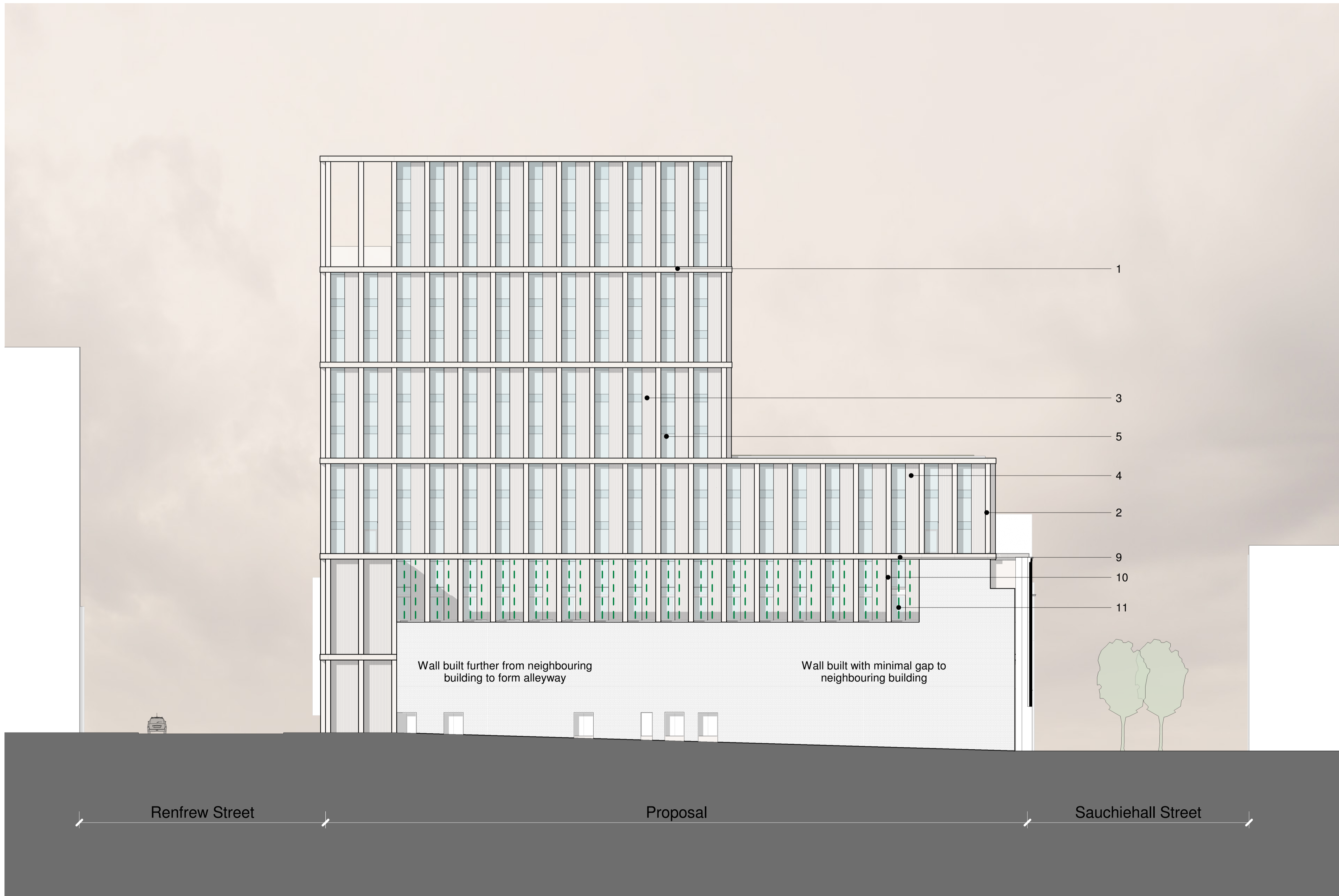
1 Elevation - West 1 : 200