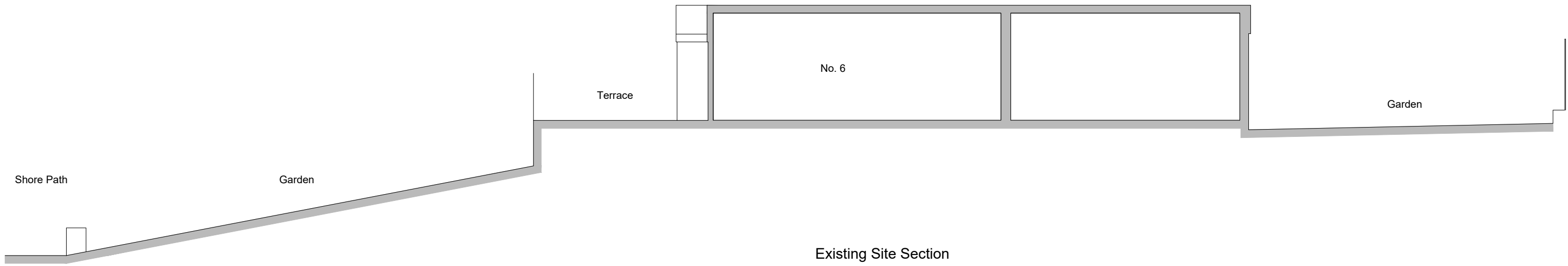
Existing Site Section