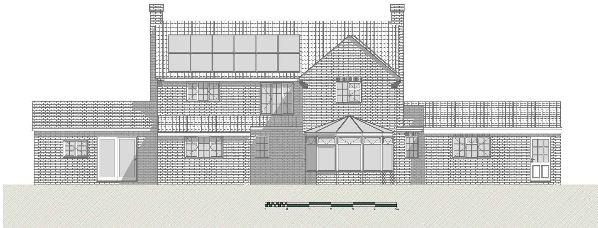
W1 Existing Rear Elevation 1:100