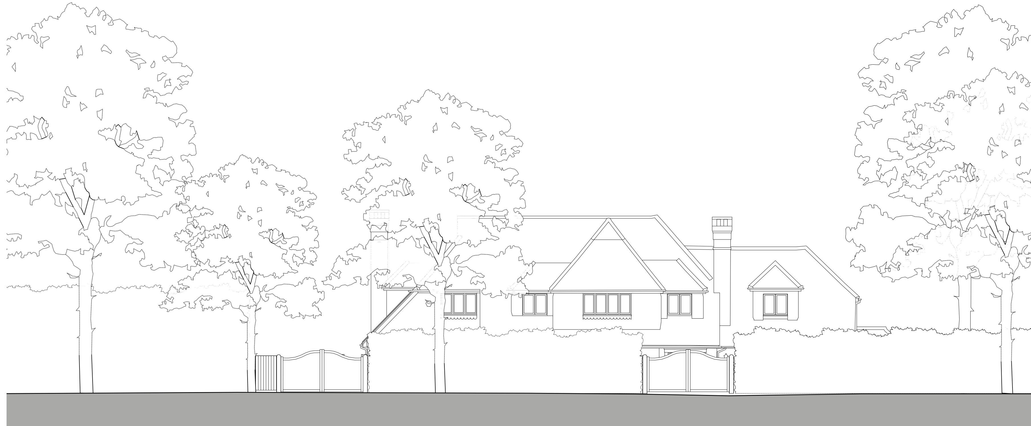
Street Scene - Existing