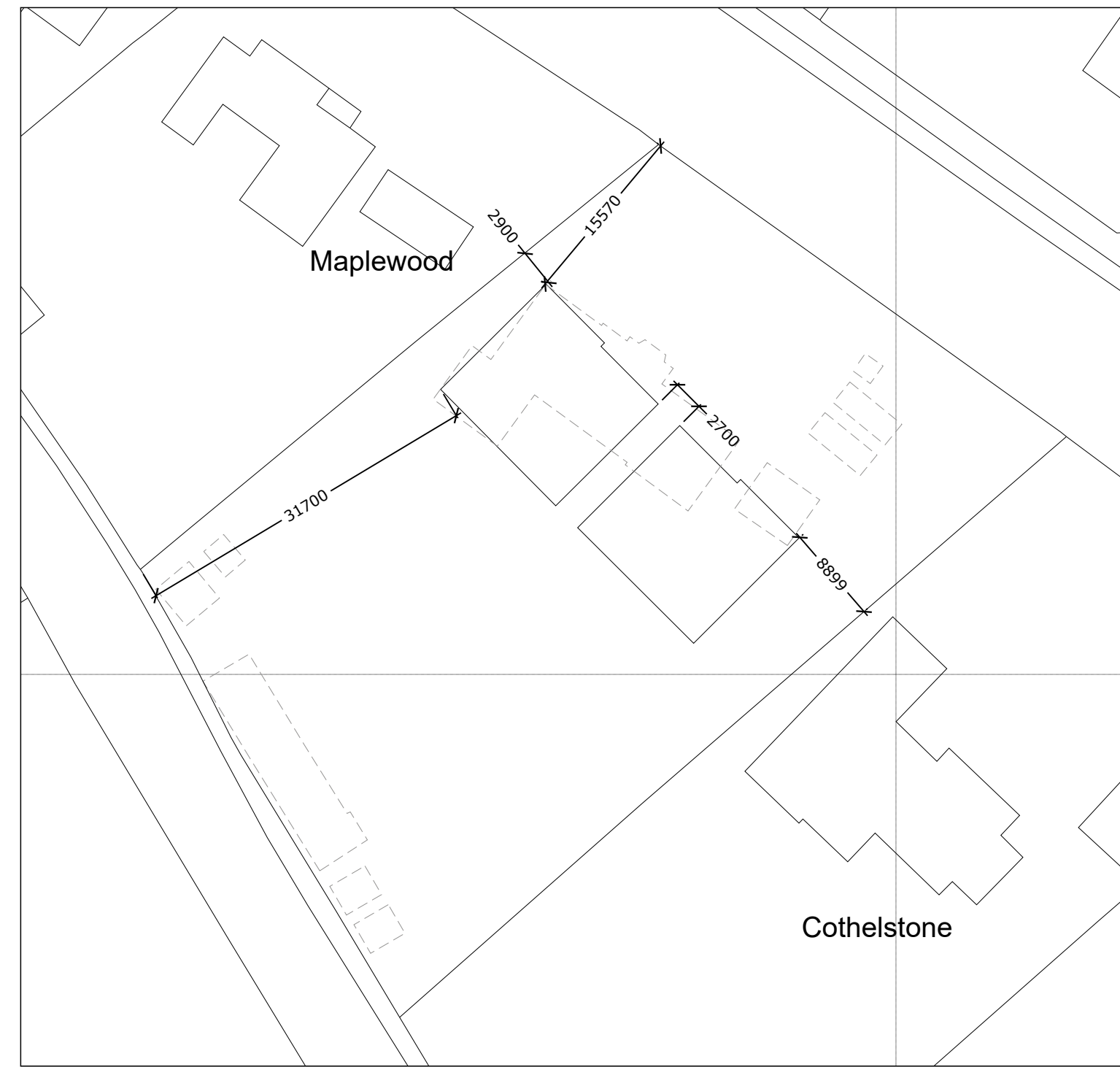
Block Plan Proposed Scale 1:500